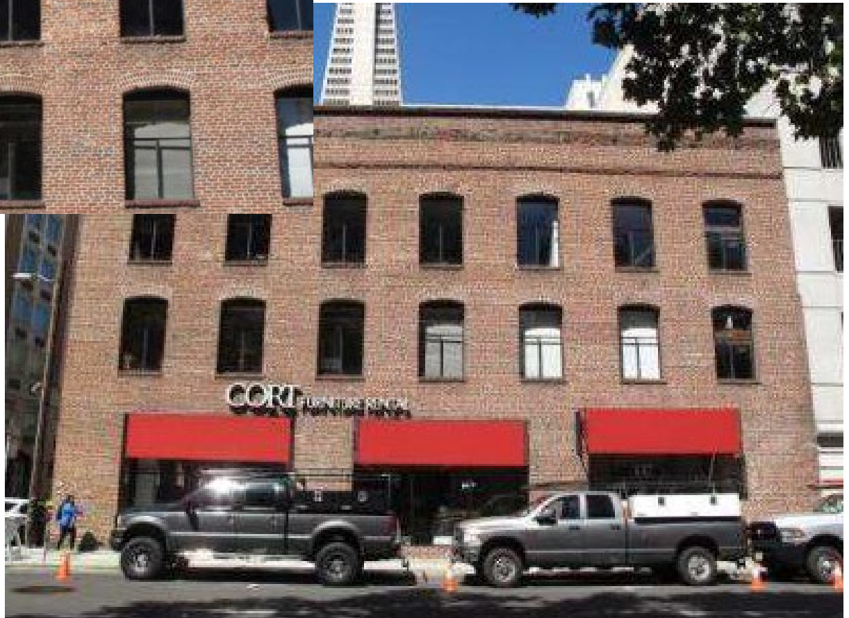
Right: Battery Street elevation, 2017