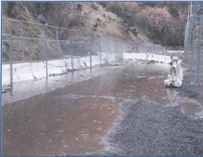
Flooding after heavy rainfall