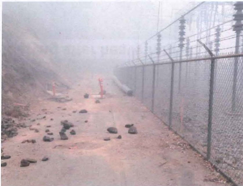
Fallen rocks, triggered by Rim fire, along edge of Switchyard

Boulder breaches two fences before coming to rest inside Switchyard