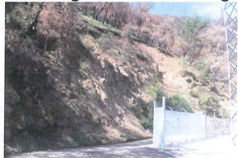
Active slide area above Switchyard