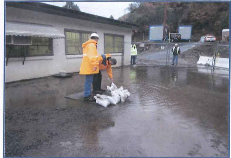
Flooding at Control Building