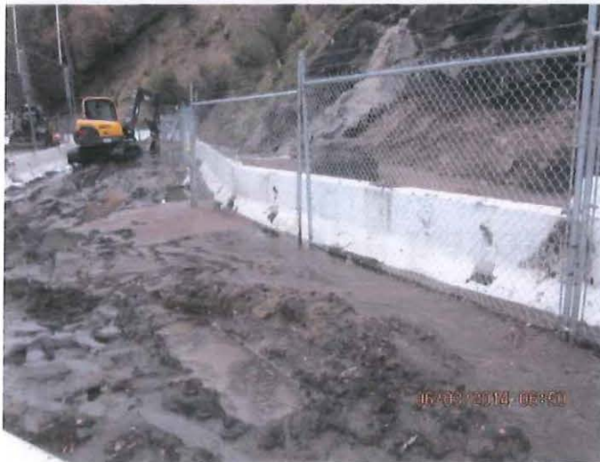
Mud after spring storms