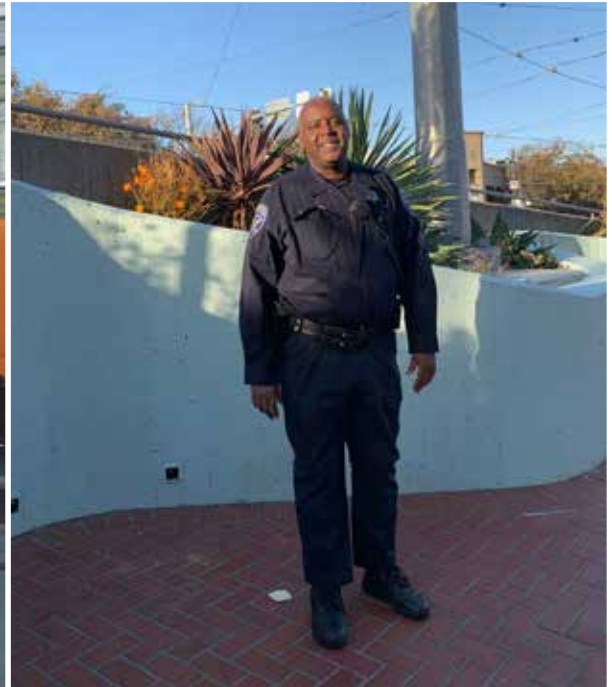
Taking Care of Our Community (Some images taken prior to shelter in place.)