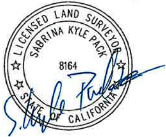
EXHIBIT A-1 ILLUSTRATIVE PLAT TO ACCOMPANY LEGAL DESCRIPTION

CANDLESTICK PARK DRIVE LOT Q, FINAL MAP NO. 12681 CITY AND COUNTY OF SAN FRANCISCO, CALIFORNIA