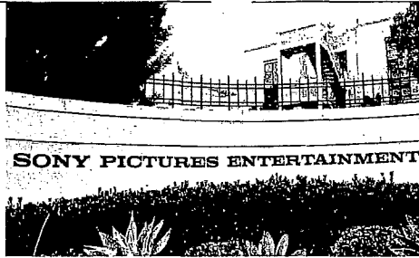
Sony Pictures Entertainment is recovering from a hacking attack that caused major computer problems at the film studio. The FBI has warned of more.

bulletin late Monday to a wide range of companies about a malicious software threat that wipes data from computers beyond the point of recovery.