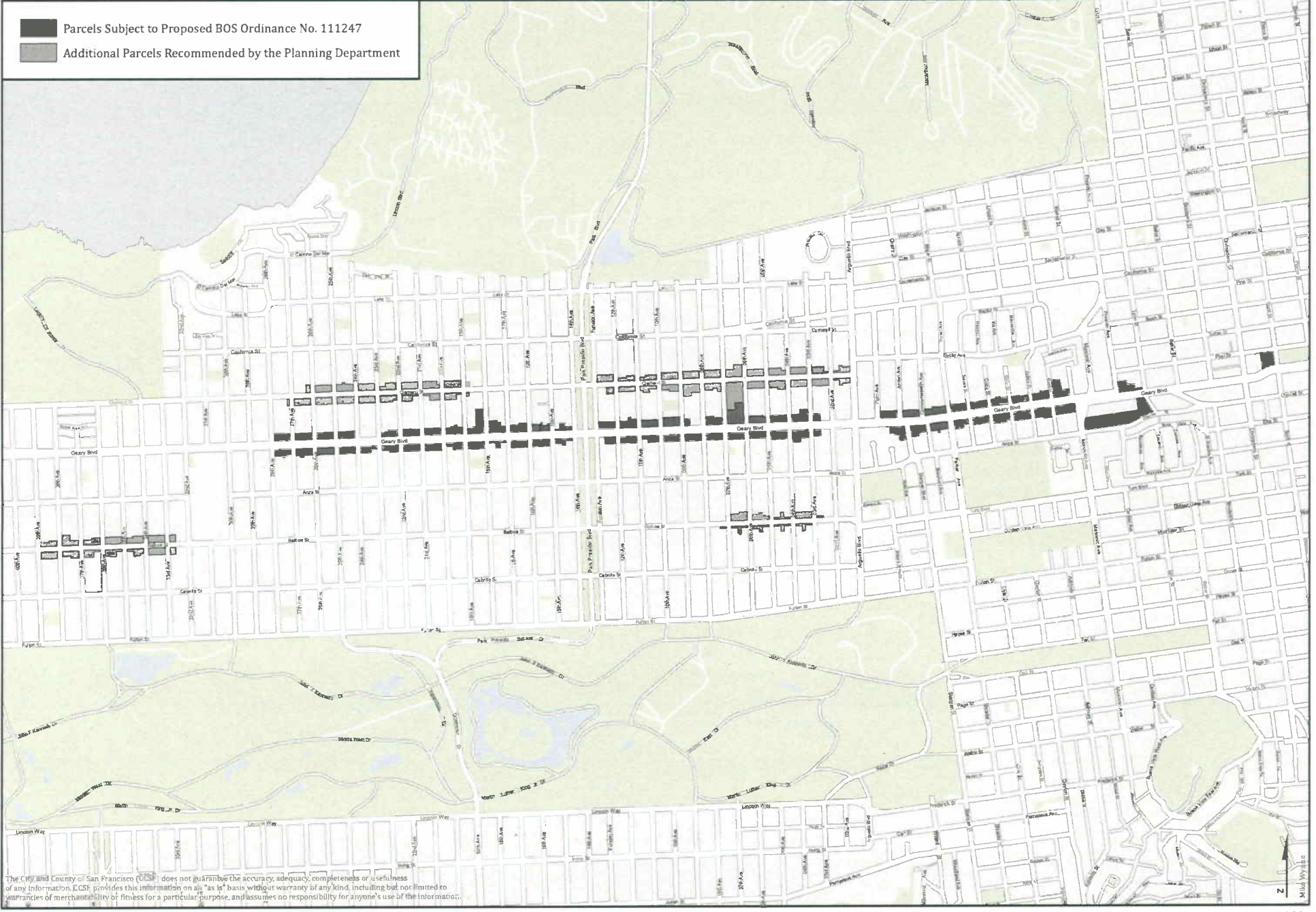
Figure 1: Parcels Proposed for 5-Foot Height Exception for Active Uses

The City and County of San Francisco (CCSF) does not guarantee the accuracy, adequacy, completeness or usefulness of any information. CCSF provides this information on an "as is" basis without warranty of any kind, including but not limited to warranties of merchantability, fitness for a particular purpose, and assumes no responsibility for anyone's use of the information.