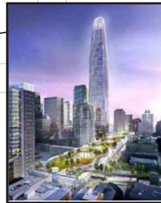
Parcel T 101 First Street Salesforce Tower Developer(s): Boston Properties/Hines Office Sq. Ft.: 1.4 Million Construction Start: 2014 Completion: 2017