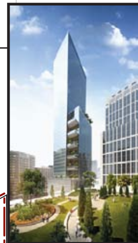
Block 5 250 Howard Street Park Tower Developer(s): Golub/ John Buck Office Sq. Ft.: 767,000 Construction Start: 2015 Completion: 2018