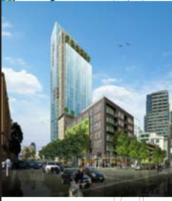
Block 6 299 Fremont Street/ 280 Beale Street (OCII Sponsored Affordable project) Developer: Golub/Mercy Market-Rate Units: 409 Affordable Units: 70 AMI: 50% and below Total Units: 391 Construction Start: 2016 Completion: 2019