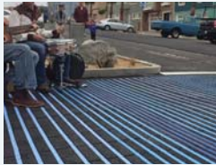
Custom Crosswalk Treatment