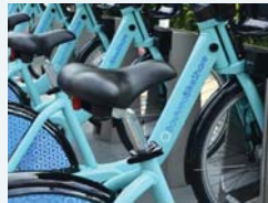
Bicycle Share Station