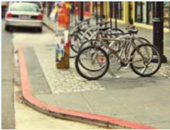
Bulbout (In 1 Direction)