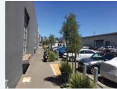
At-Grade Ped Path (Interim Solution)