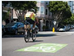
Class III Bicycle Route