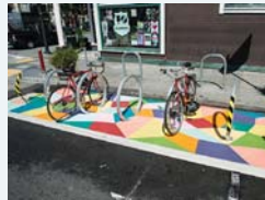
Bicycle Corral/Bike Parking