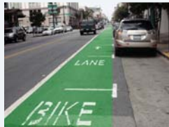
Class II Bicycle Lane