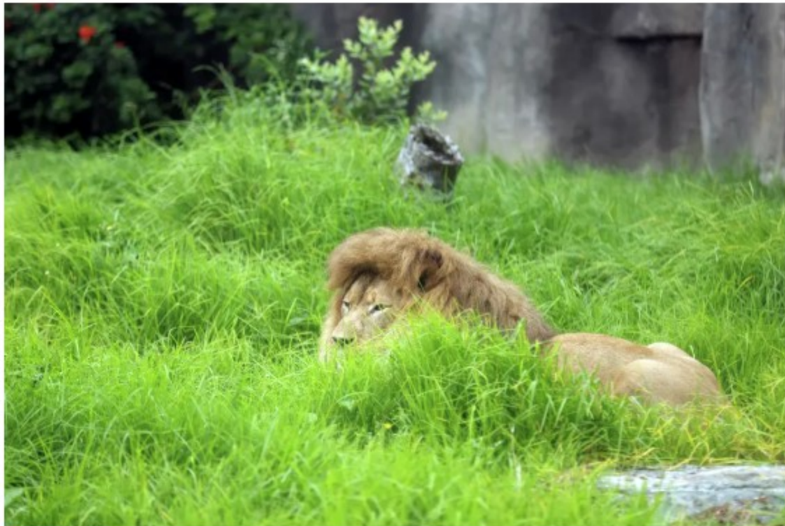
A lion in Cat Kingdom at San Francisco Zoo in 2025. An audit released Friday found widespread failures in management, oversight and financial planning at the zoo.