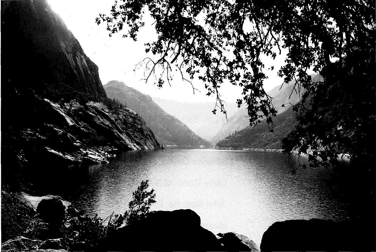
Hetch Hetchy Reservoir