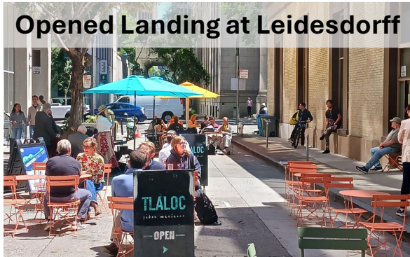
Opened Landing at Leidesdorff