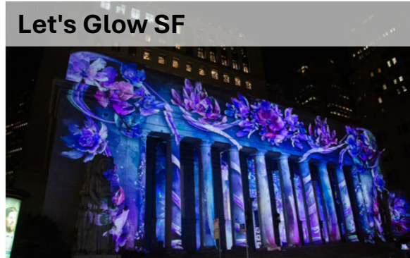
Let's Glow SF