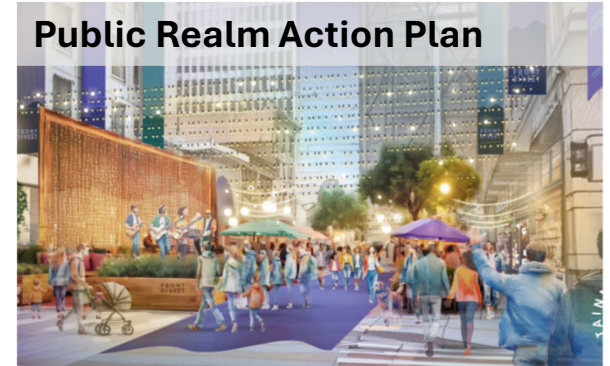
Public Realm Action Plan