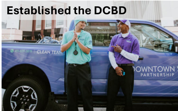
Established the DCBD