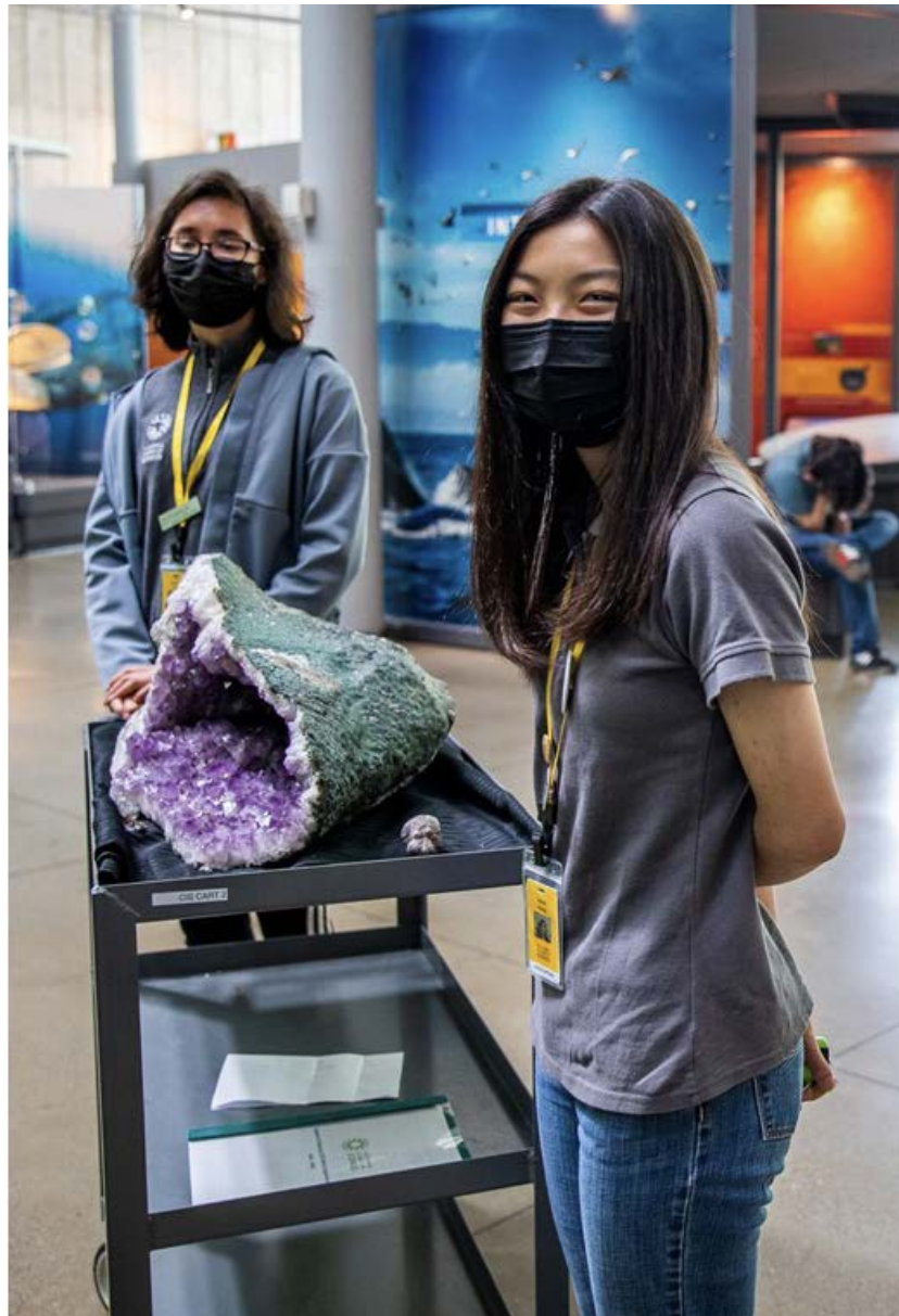
Careers in Science