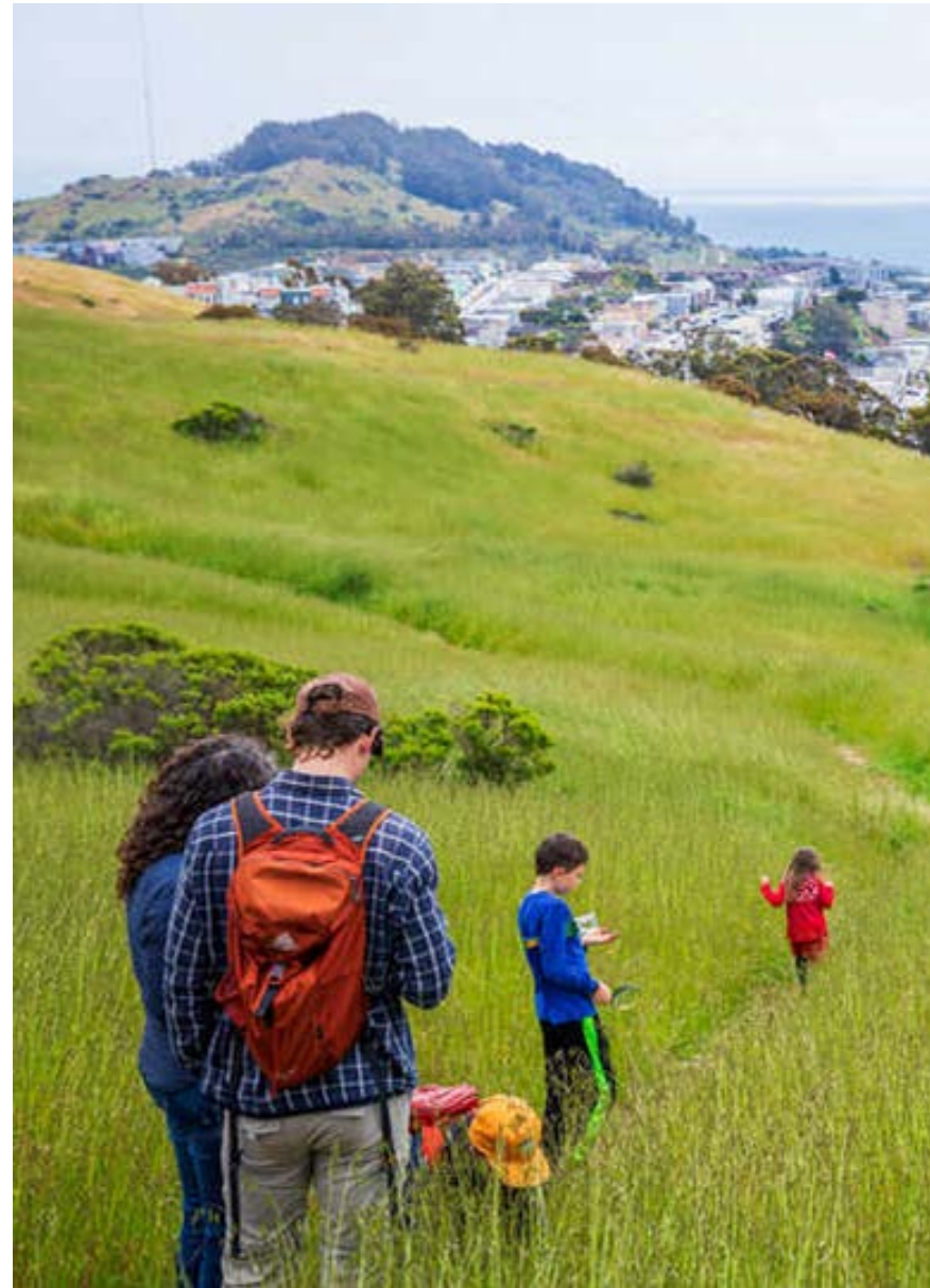
Family Nature Clubs