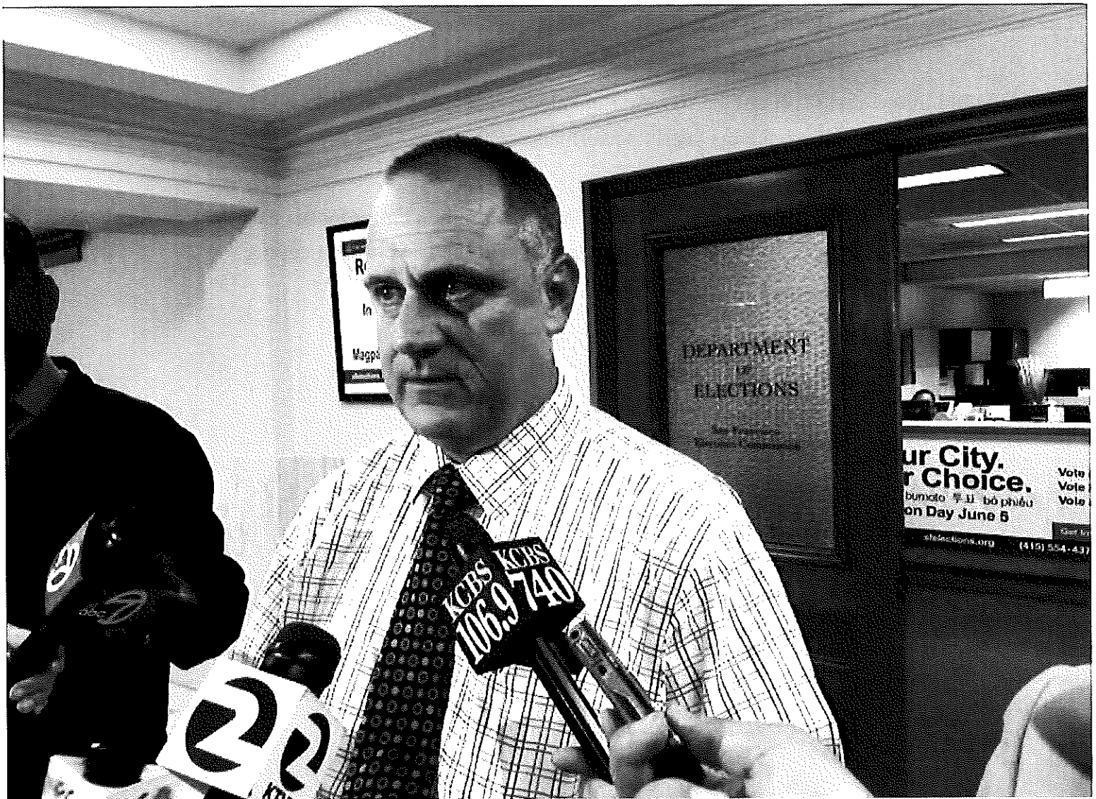
John Arntz in 2018.

Peskin contrasted the “Wild West” behavior and distrust of the Elections Department two decades ago with the “smooth-running machine” under Arntz. In a nation where increasing portions of the populace voice ill-founded concerns about the sanctity of elections, no serious people in San Francisco are doing that.