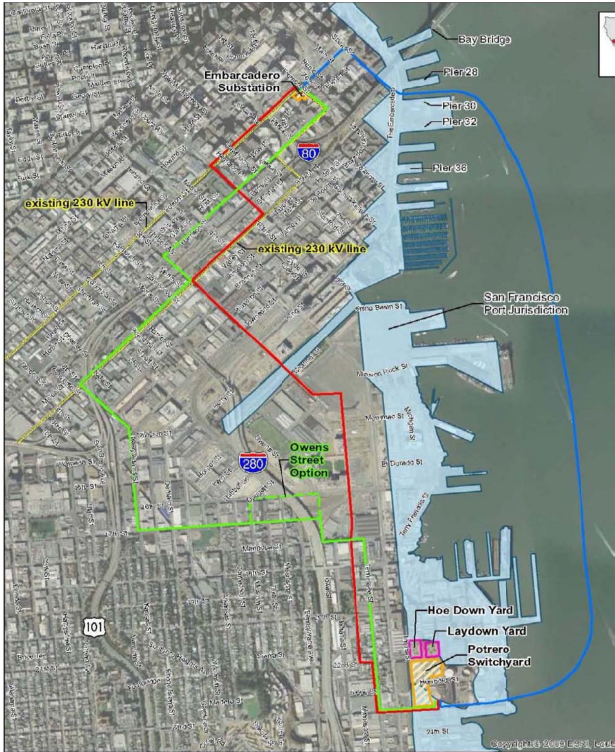
Exhibit 1: Embarcadero-Potrero 230 kV Cable Project