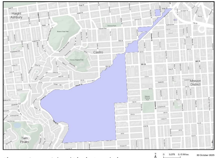
Figure 1. Current Cultural District Boundaries

Administrative Code Section 107B.1 currently lists findings supporting the cultural significance of the Castro LGBTQ community within the existing Cultural District boundaries.