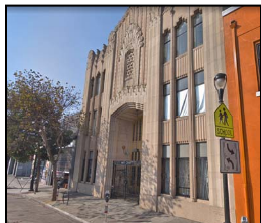
Front entrance at Valencia Street of subject site