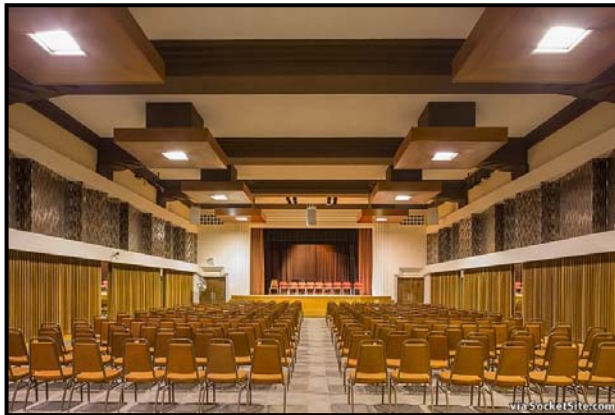
Auditorium at 170 Valencia Street

In September of 2018, the Zoning Administrator determined that the proposed uses of the site at 170 Valencia Street by the SFGMC constituted a Community Facility use (see exhibit B). A Community Facility