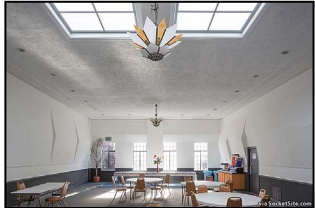
Meeting Room at 170 Valencia Street

use is permitted in NCT-3 Districts; however it requires a Conditional Use authorization in RTO Districts. The result is that the front half of the subject site, which faces Valencia Street and is zoned NCT-3, is allowed to operate as a Community Facility, but the back of the site must obtain a Conditional Use authorization as it is zoned RTO.