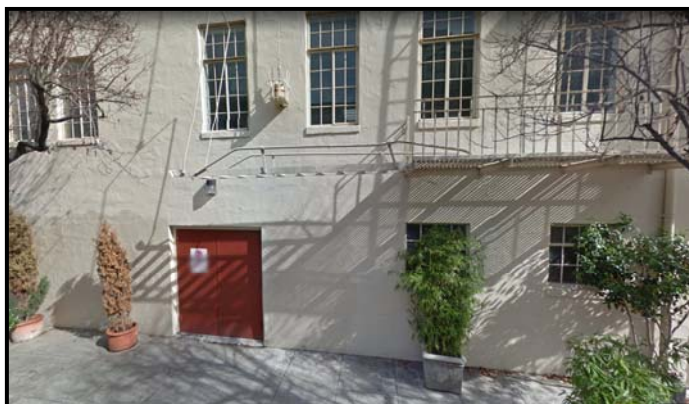
Service entrance from Elgin Avenue to 170 Valencia Street

The composition of land uses in the area immediately surrounding the subject site is varied. Generally, the current zoning which splits the subject site's city block is appropriate for the neighborhood, as there is a stark contrast between the land uses on the east side of the block (Valencia Street), and the west side of the block (Elgin Avenue). In addition to the former Baha'i Temple building, the land uses along this block of Valencia Street consist of commercial uses such as an oil change station, several restaurants, and a furniture store. The land uses along Elgin Avenue at the back of the subject site are largely multi-unit residential and mixed-use residential. Though generally appropriate for this block, the current zoning fails to take into account the building at 170 Valencia. The subject building is one unit, and though there is a service entrance that faces onto Elgin Avenue, the main entrance is located on Valencia Street. The building has been used as a Community Facility use since its construction, and intends to remain as a Community Facility when the SFGMC moves in.