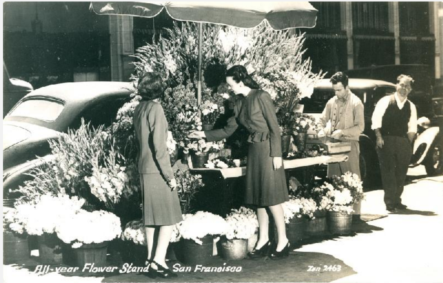
Flower Stand at Grant near Geary circa 1940