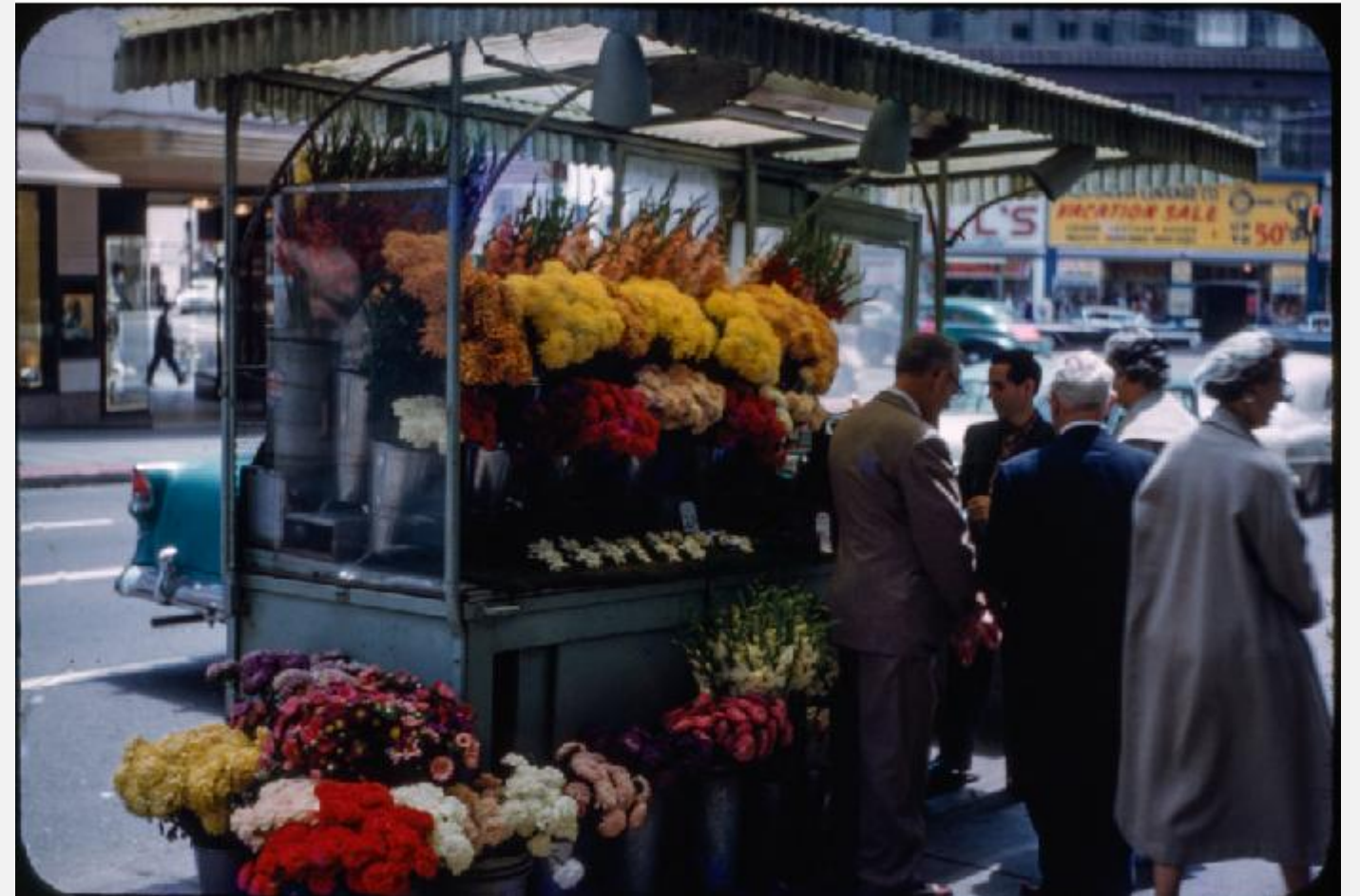
Flower Stand at Stockton near Ellis 1959