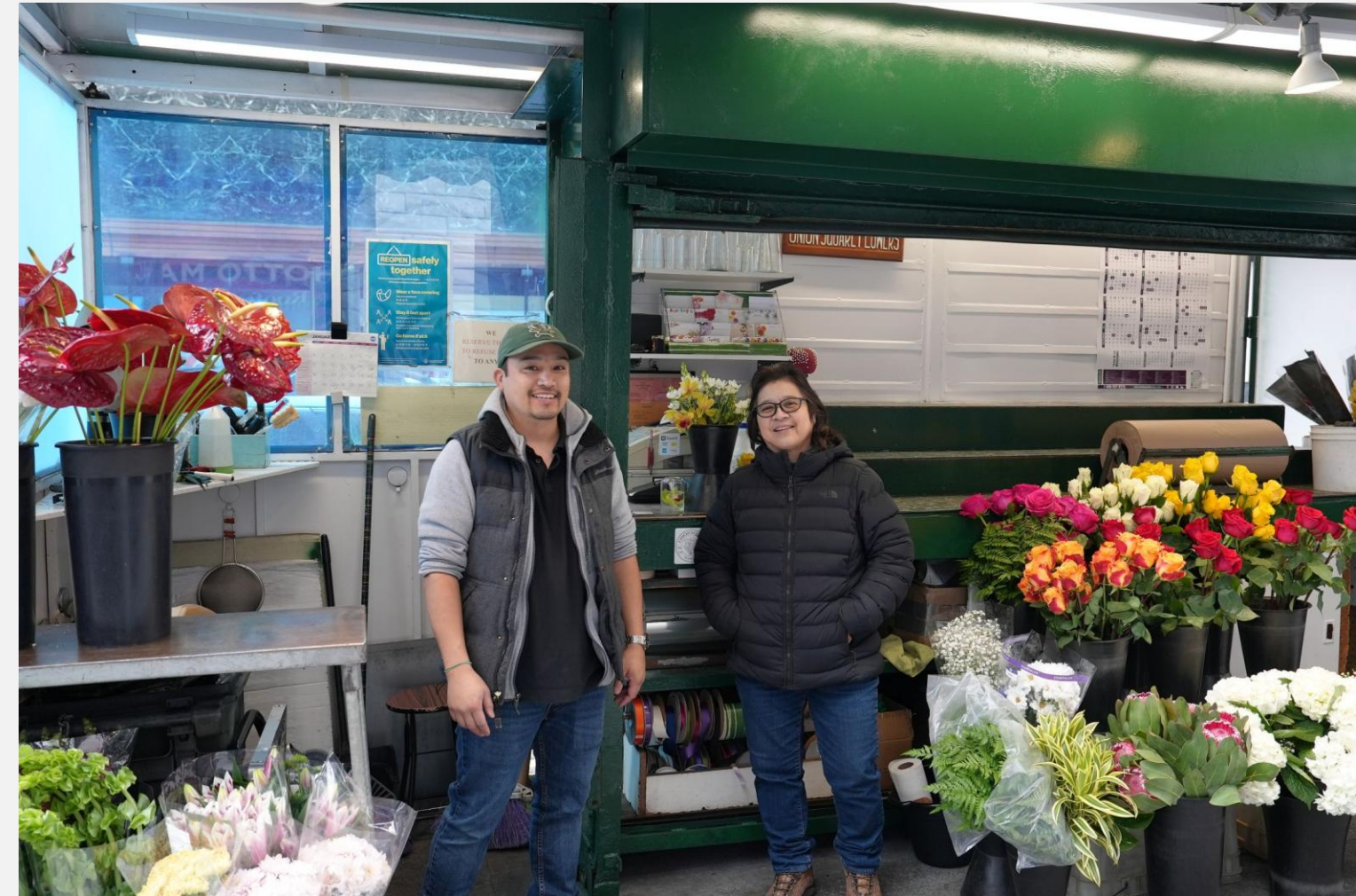
Stockton St. and O'Farrell St.