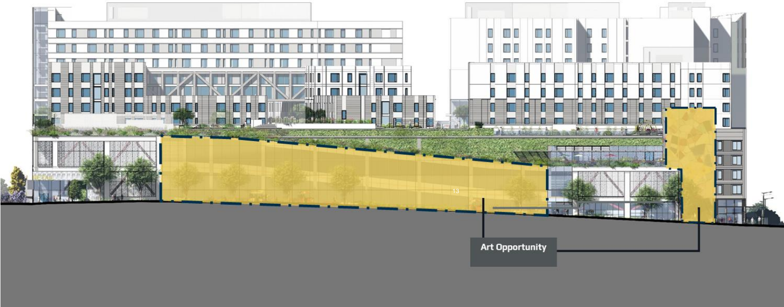
Conceptual rendering, not final design