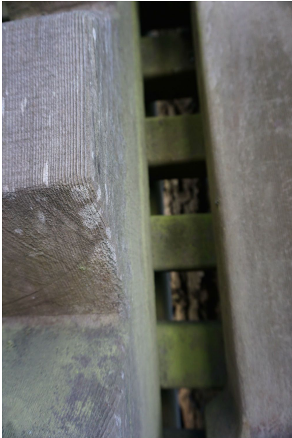
Figure 3: Green Biogrowth Present on Group 1 (Left)