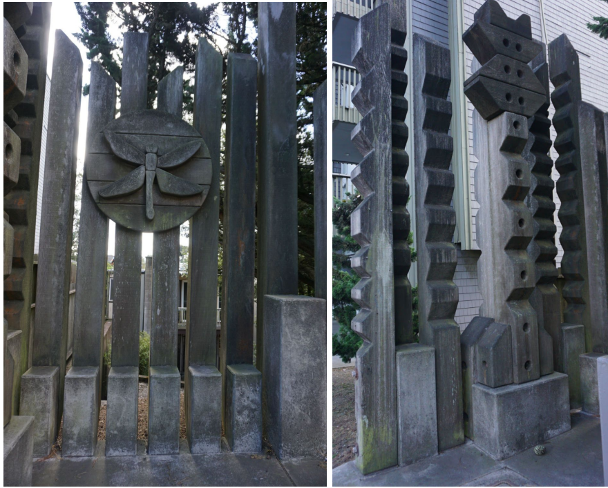
Group 7 (Left) and Group 8 (Right)