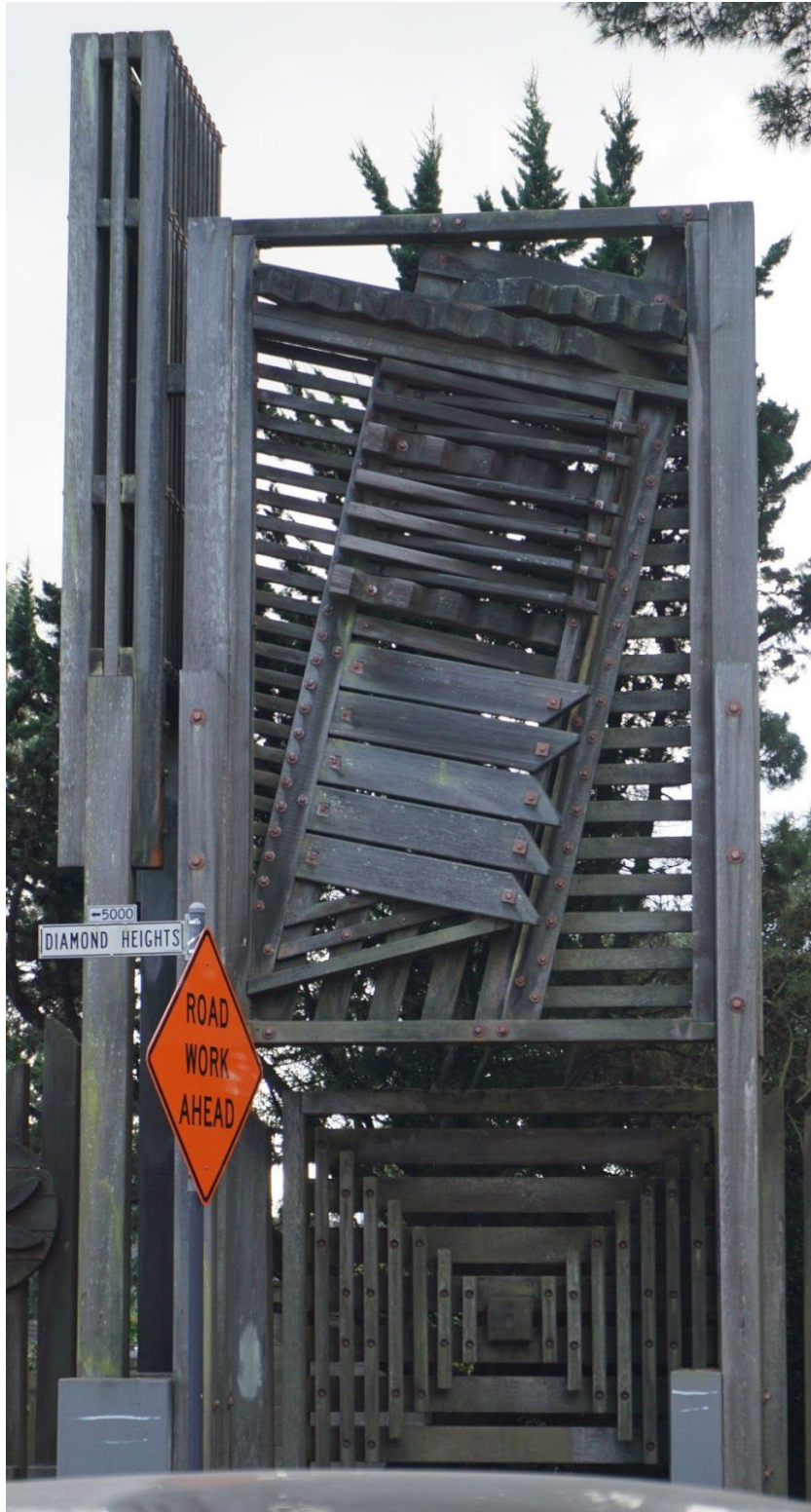
Main Group, 'Tower'