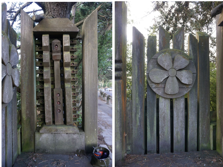
Group 1 (Left) and Group 2 (Right)