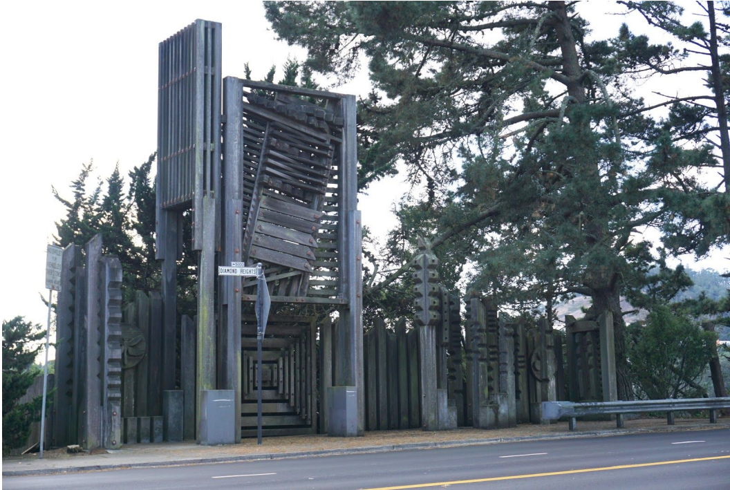
Overall Front View

A numbering plan was devised for identifying the sections. Group 1 is the Proper Left side, and goes along the back wall to the Proper Right End of the Sculpture and then across the front elements. The groups were defined by natural groupings to the artwork itself.