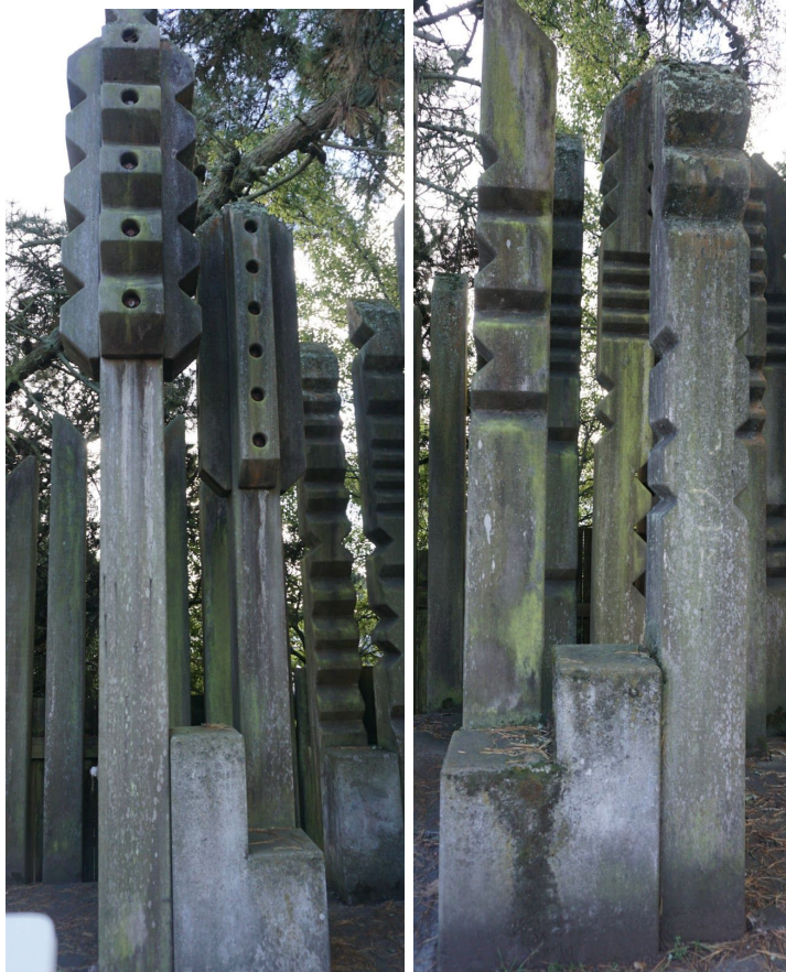
Group 9 (Left) and Group 10 (Right)