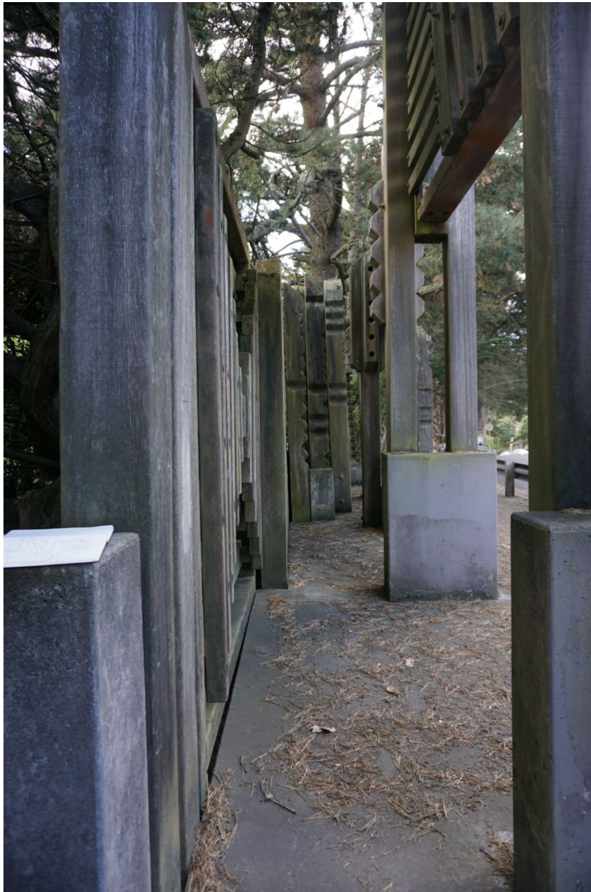
Figure 1: A View of the Interior of the Artwork Looking Towards the East. The slab appears to be subsiding towards the rear wall.