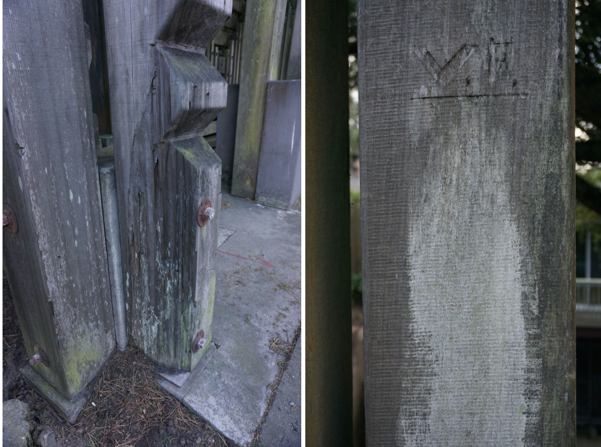
Figure 5: Group 8-Loss of Timber to Outermost Post (Left)