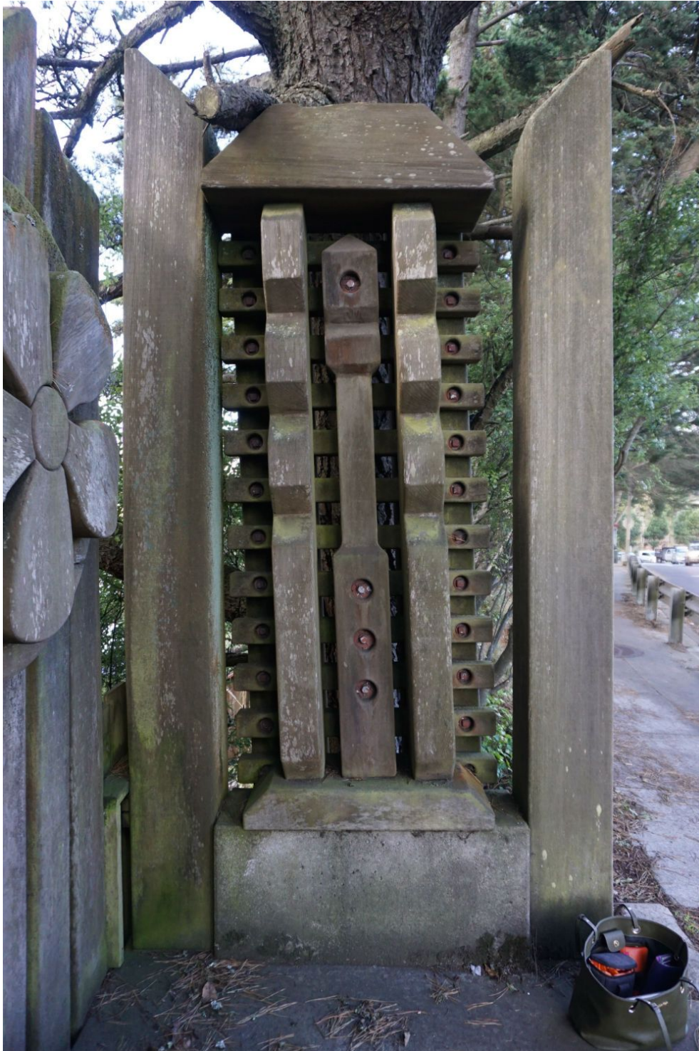
Figure 2: Group 1 Verticals Leaning Under Pressure of the Tree Branch