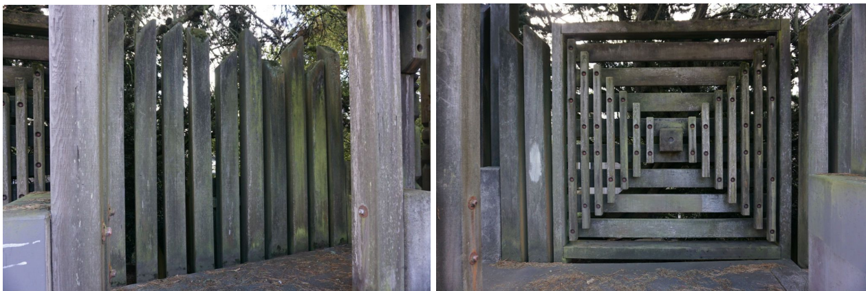
Group 5 (Left) and Group 6 (Right)