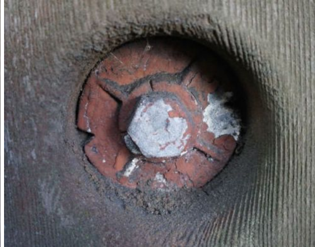
Figure 4: Bolt Head and Washer with Deteriorated Paint Layer (Right)