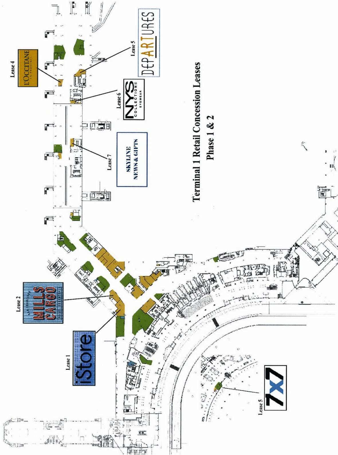
Terminal 1 Retail Concession Leases Phase 1 & 2