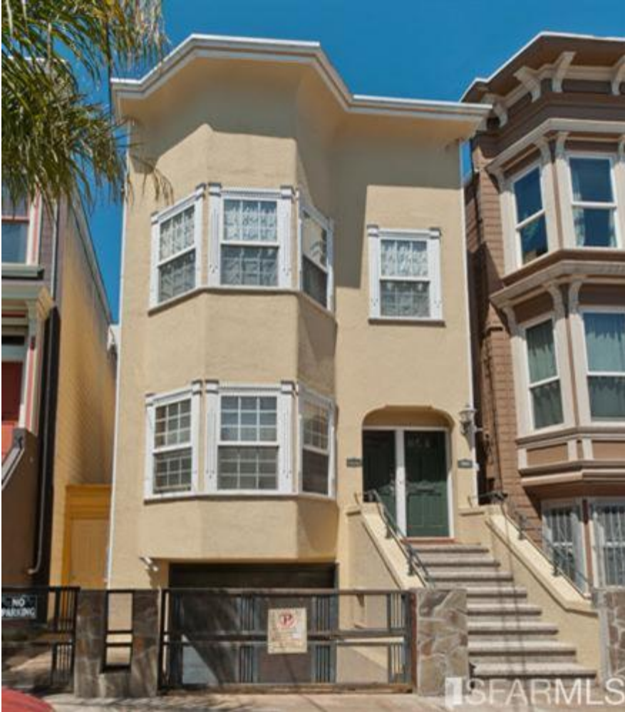
Figure 1. Before image of 354-356 San Carlos St. taken in 2012. Front facade view looking east.