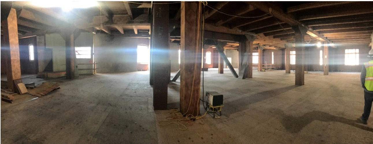
Above: Southeast addition interior, second story. Middle: Northeast addition interior, second story. Below: Main building interior, second story.