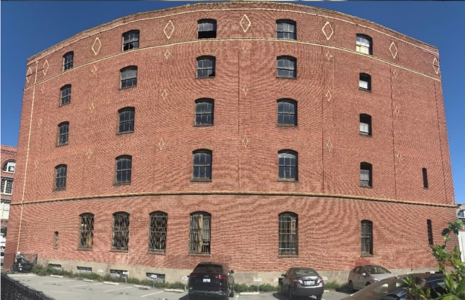
Above: North façade. Architectural Resources Group, July 2019 Below: Northwest façade Planning Department Staff, August 2021