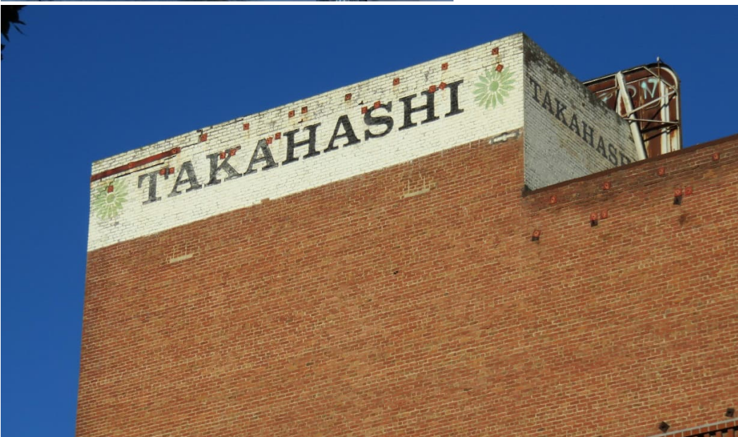
Above Left: Southeast entrance with signage. Architectural Resources Group, July 2019 Above Right: View from northeast along facade. Planning Department Staff, August 2021 Below: Detail of signage at roofline of east façade. Architectural Resources Group, July 2019