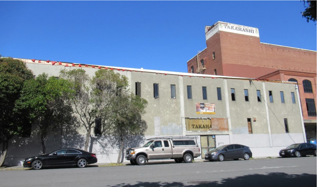
Above: View from Southeast. Planning Department Staff, August 2021 Below: Southeast façade. Architectural Resources Group, May 2019