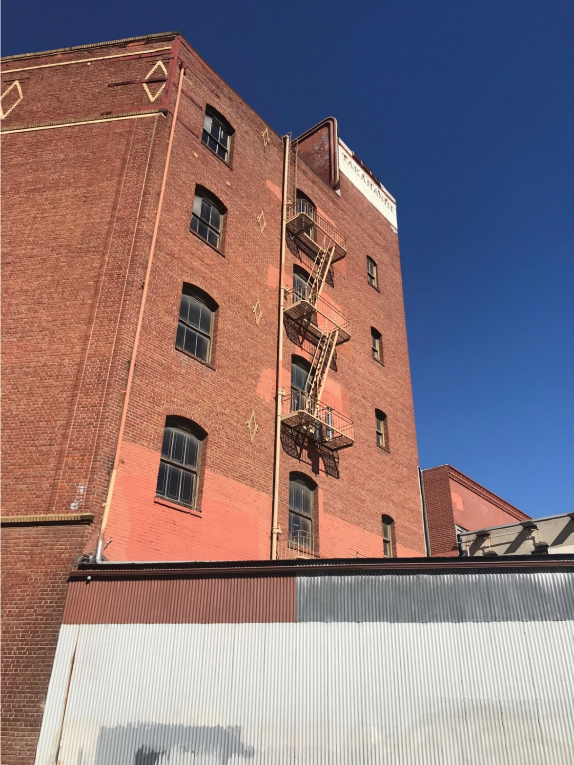
South façade of original building. Planning Department Staff, August 2021.