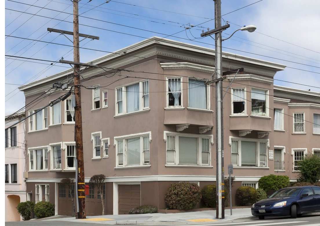
4042-4048 Fulton St @ 17 th Avenue