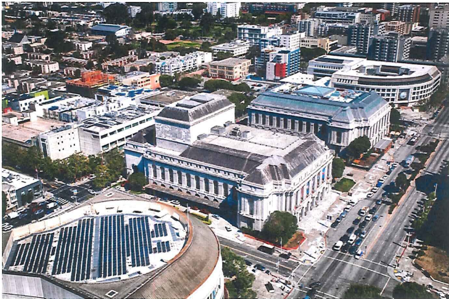
PUC solar panel installation on Davies Symphony Hall.