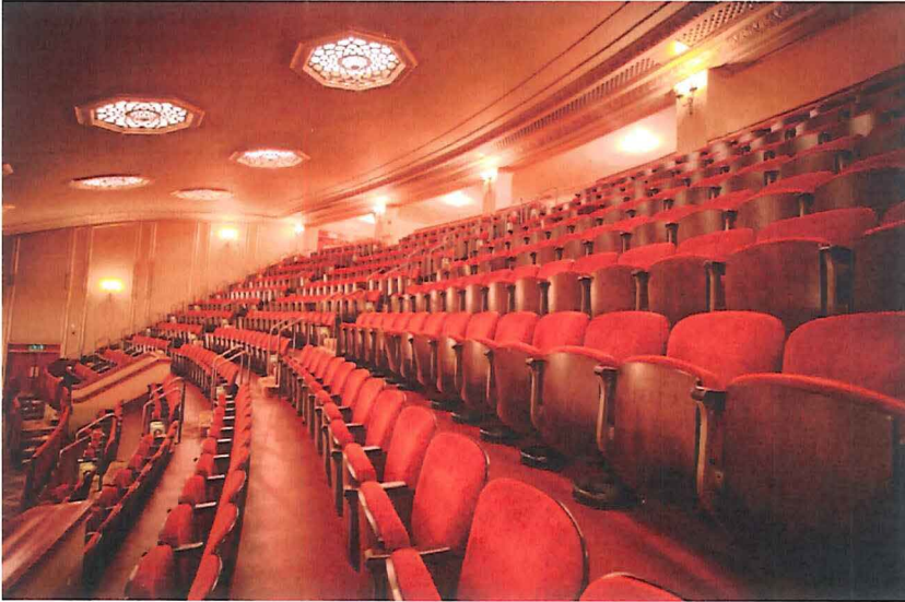
Replaced 1932 Opera House Balcony Seats in August 2015.