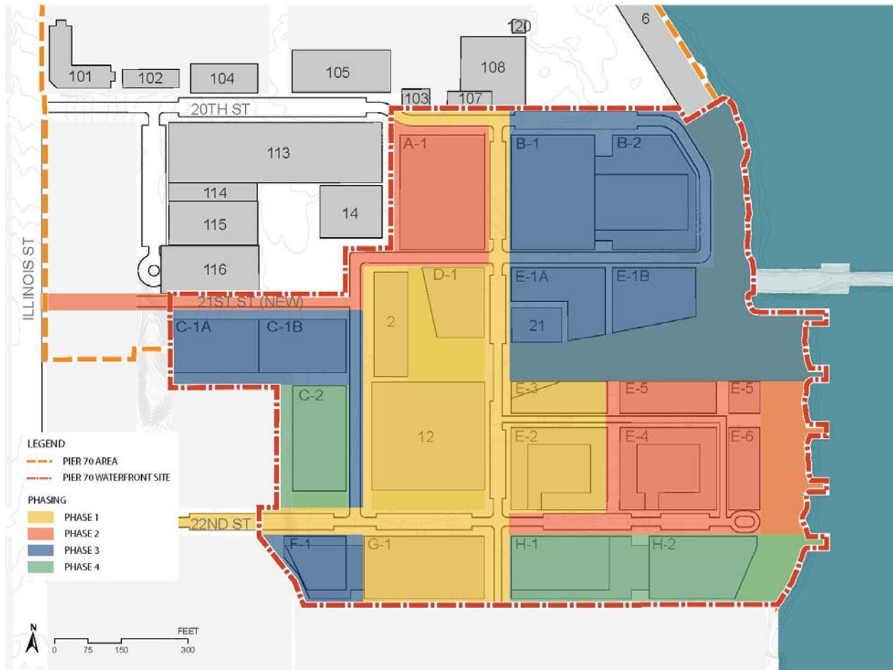
Figure 2: Proposed Waterfront Site Project

constructed buildings (vertical development) and historic rehabilitation of existing industrial buildings (historic improvements) consistent with the Secretary of the Interior's Standards for the Treatment of Historic Properties. The proposed Waterfront Site project is pictured below in Figure 2.