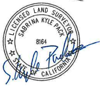
EXHIBIT A-1 ILLUSTRATIVE PLAT TO ACCOMPANY LEGAL DESCRIPTION

CANDLESTICK PARK DRIVE LOT Q, FINAL MAP NO. 12681 CITY AND COUNTY OF SAN FRANCISCO, CALIFORNIA MAY 26, 2026