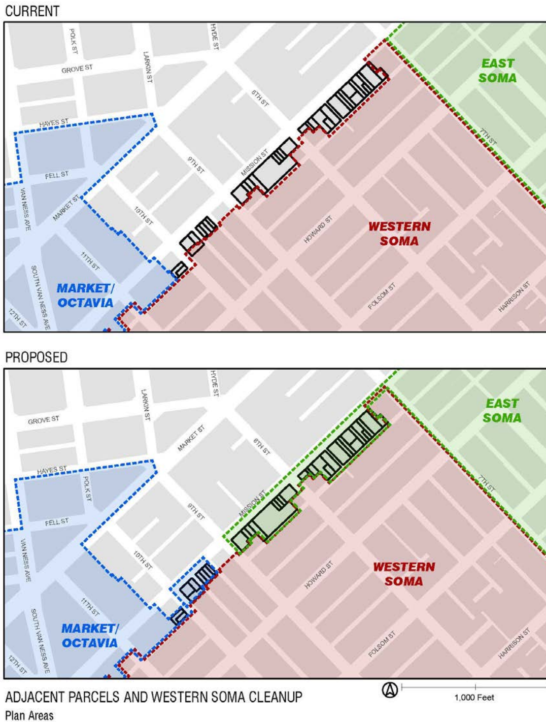
Figure 2 – Allocation of Adjacent Parcels into East SoMa Plan and the Market and Octavia Neighborhood Plan