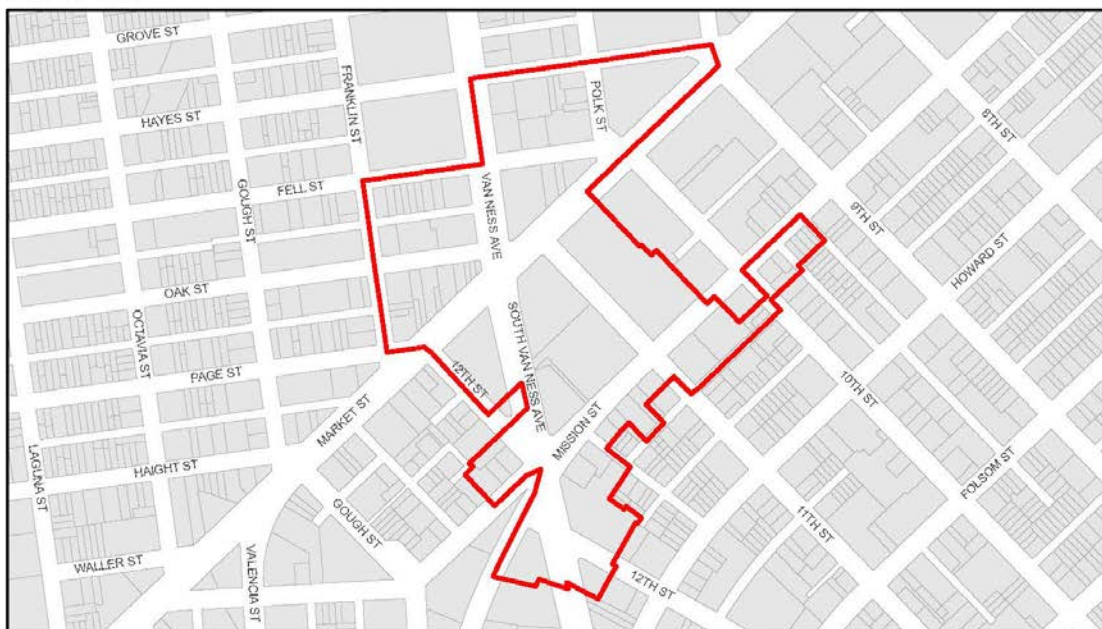
ADJACENT PARCELS AND WESTERN SOMA CLEANUP Van Ness & Market Downtown Residential Special Use District