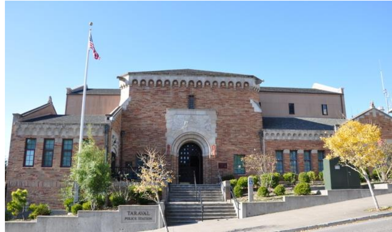
Built in 1915, the Taraval Police Station's historic building has a high probability of collapsing after a major earthquake and would not be operational, potentially increasing response times and delaying service.