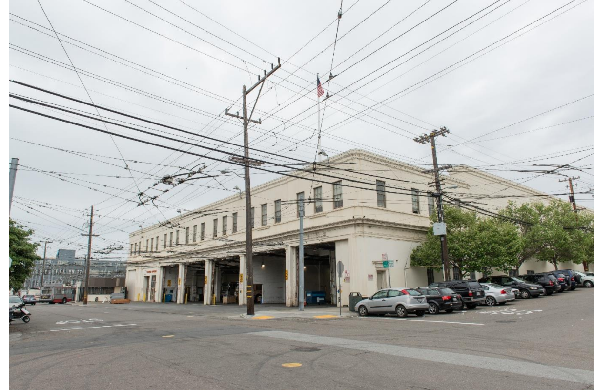
The Potrero Yard is more than a century old and long past its lifespan.