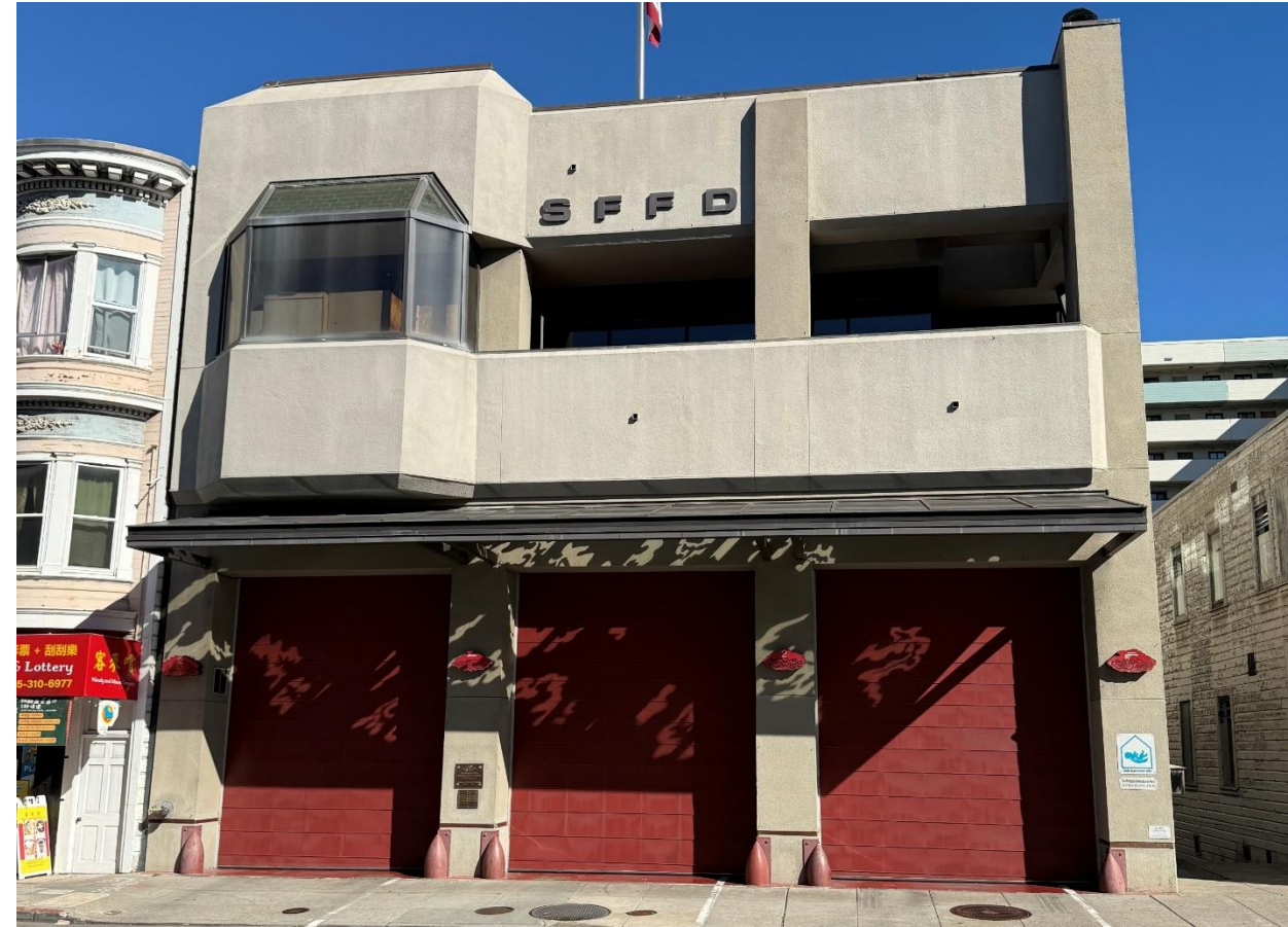
In a 2017 Public Works seismic survey, Fire Station 2 was listed as a high safety hazard with an SHR rating of 4, placing it in the highest risk category.