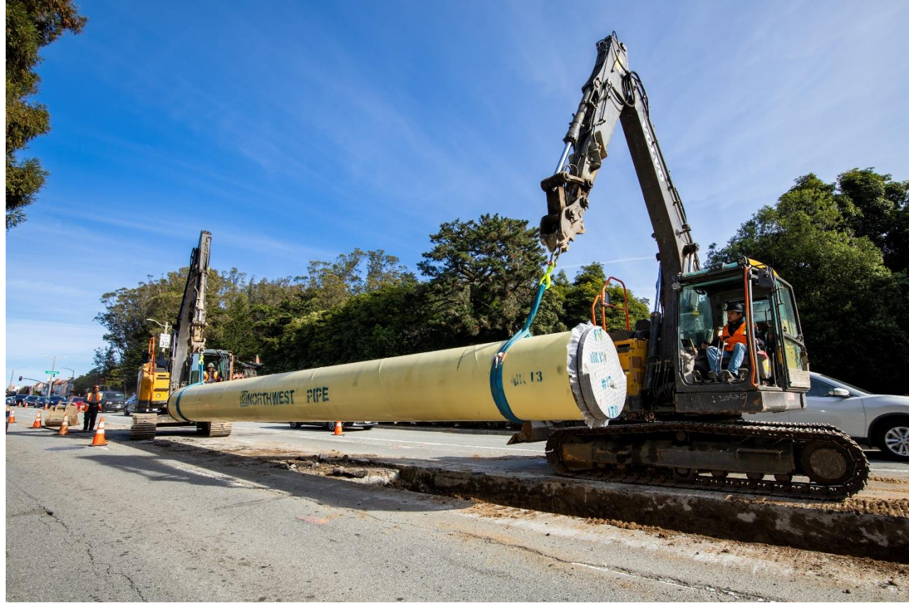
New pipe for Potable Emergency Firefighting Water Systems pipeline at 19th Ave and Sloat Blvd.