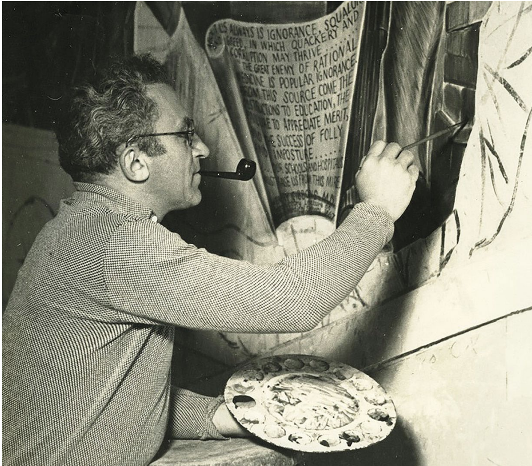
Bernard Zakheim painting "History of Medicine in California" fresco, 1937.