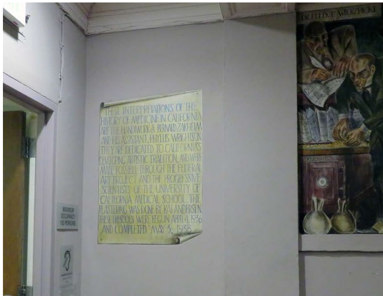
Fresco 1 (Dedication scroll)