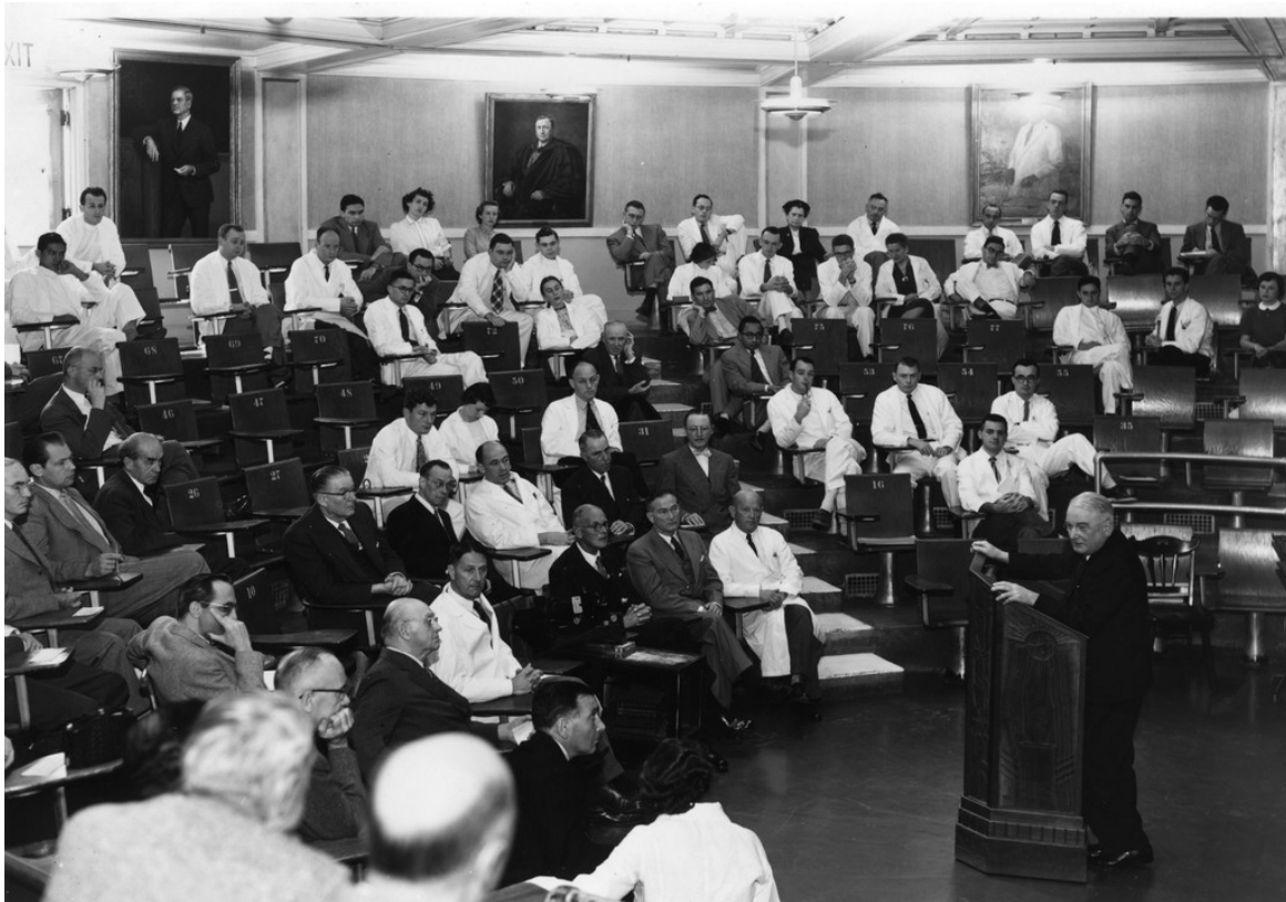
Toland Hall, view of curved south wall with frescoes covered, 1953.