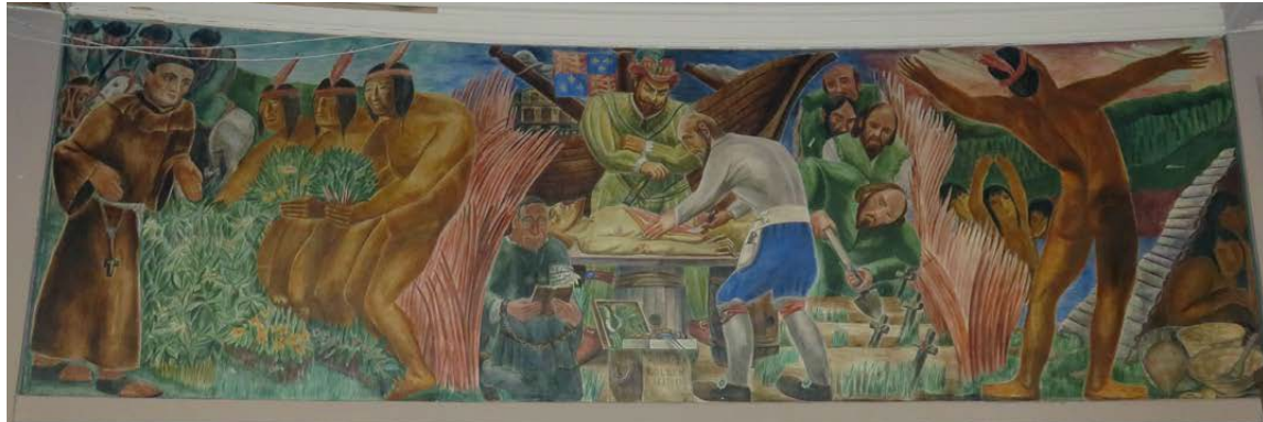
“History of Medicine in California”