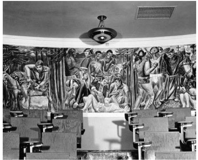
1939 Photographs of Toland Hall From Page & Turnbull, 2005. UC Hospital, 533 Parnassus Avenue, University of California, San Francisco Parnassus Heights Campus San Francisco, California, Historic American Building Survey Documentation , November, 49-50.