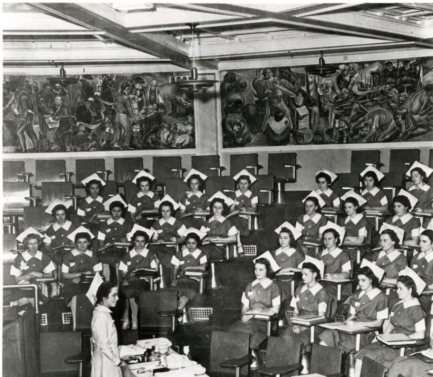
Toland Hall in use as a lecture hall, showing the Zakheim murals in place, 1941.