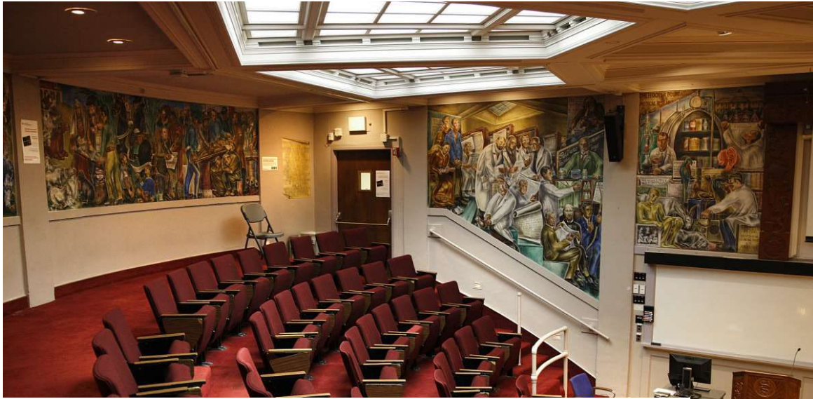
Toland Hall, view northwest, 2015.