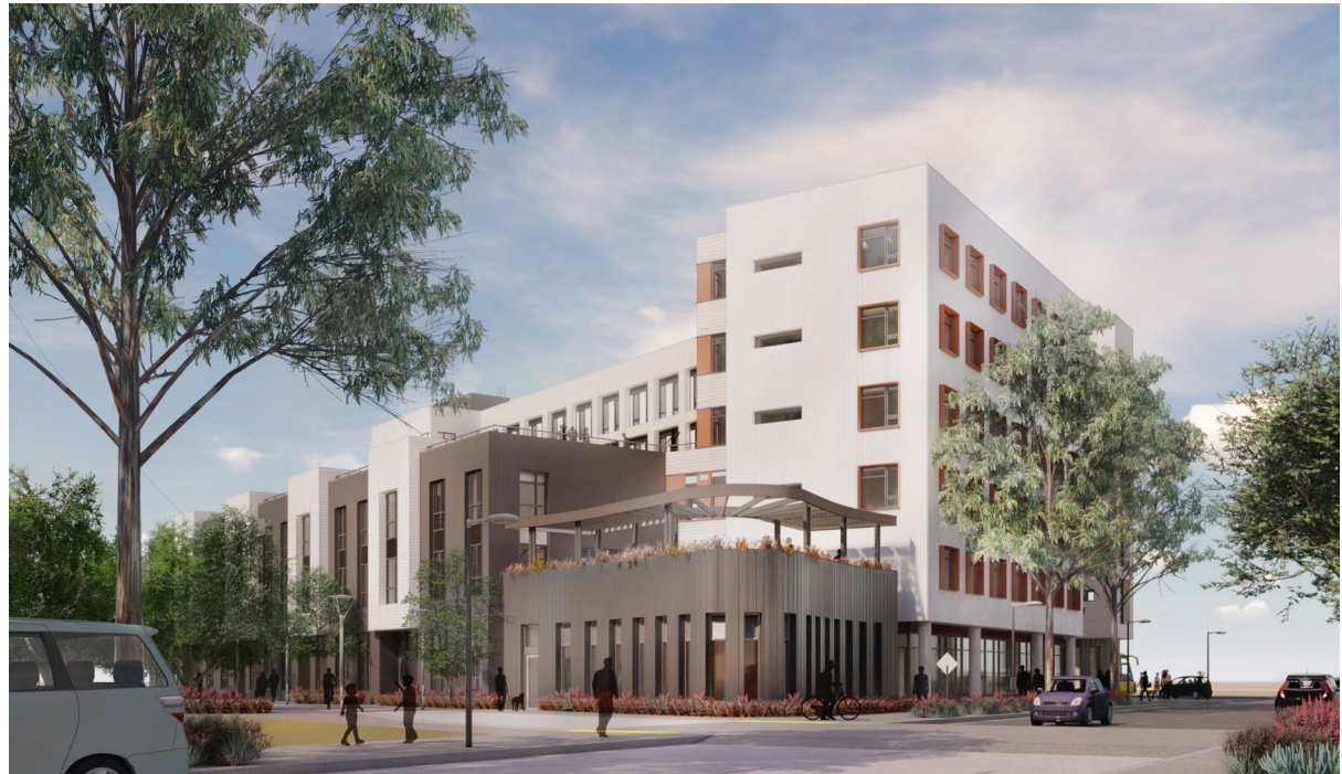
Facing east along Cravath Street towards Seven Seas Avenue.

Sponsors raised $600,000 from Home Depot Foundation and National Equity Fund