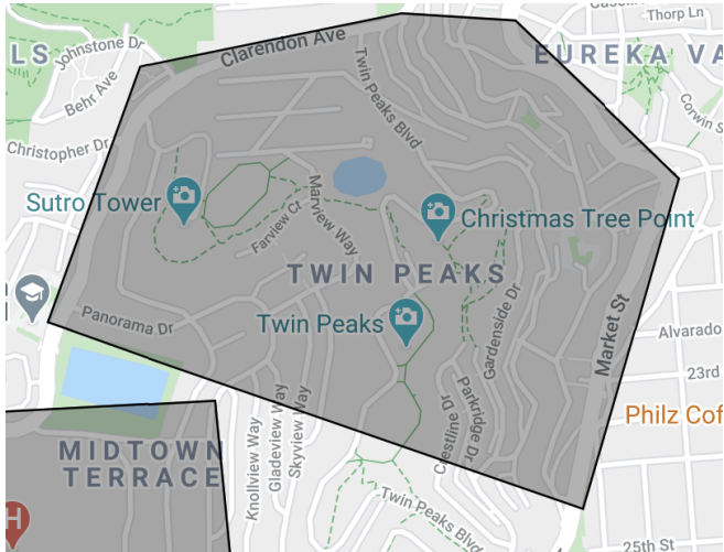
[Image description: The image shows a screenshot of a mapped area around the Twin Peaks Radio Tower site.]