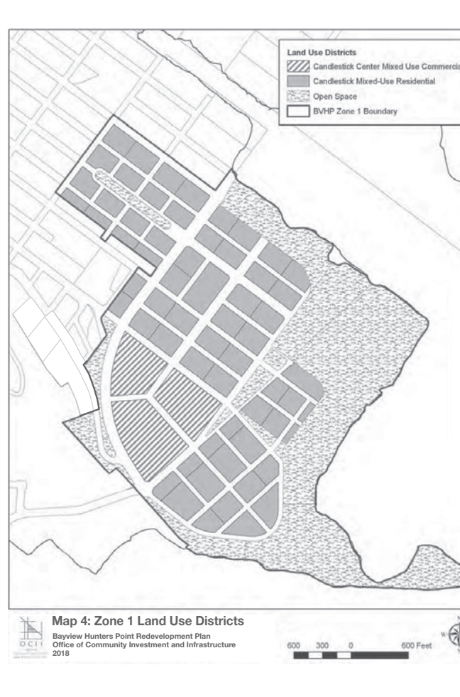
Map 4: Zone 1 Land Use Districts Bayview Hunters Point Redevelopment Plan Office of Community Investment and Infrastructure 2018