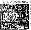
Captain David Lazar

Population: 123,980 Area: 6.5 Square Miles