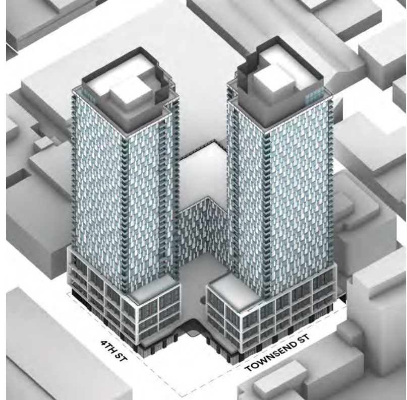
Solomon Cordwell Buenz