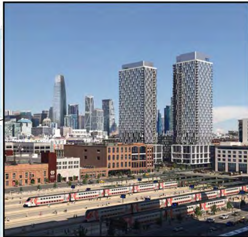
Solomon Cordwell Buenz