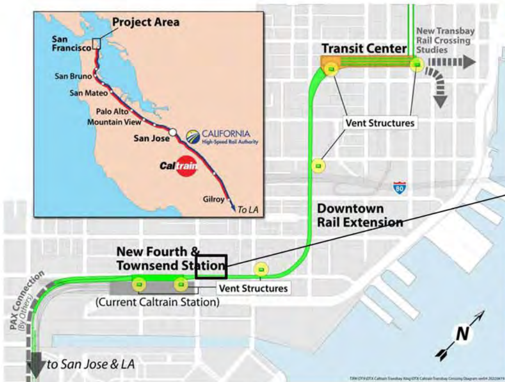
Transbay Joint Powers Authority