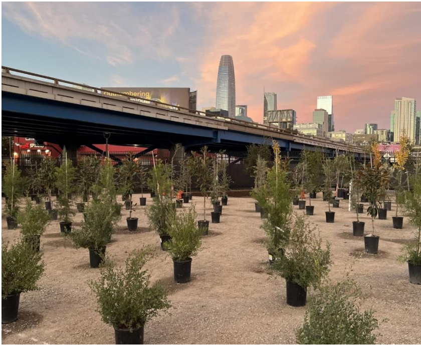
SOMA Street Tree Nursery

The City and County of San Francisco's 2025 Hazards and Climate Resilience Plan (HCR) is an action plan for reducing the impacts of hazards that have long been a part of life in San Francisco, such as earthquakes, and hazards that are becoming more frequent and severe due to climate change, including flooding, drought, extreme heat, and poor air quality. The HCR is a combined hazard mitigation and climate adaptation plan and is closely aligned with the City's Safety and Resilience Element of the General Plan and the Climate Action Plan. It includes goals, objectives, and actions to increase the resilience of San Francisco's buildings, infrastructure, and communities. By making hazard information more accessible, engaging the community in plan development, and identifying priority resilience actions, the Hazards and Climate Resilience Plan (HCR) is an important tool for building a safer and more resilient future in San Francisco.