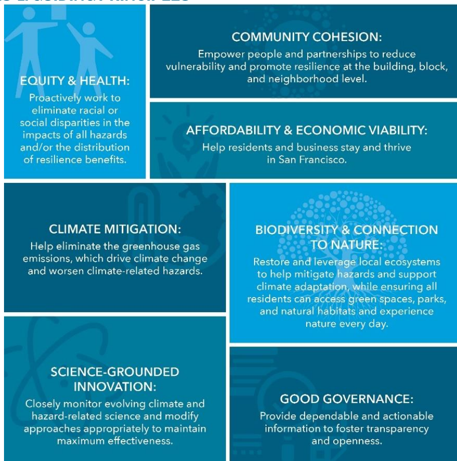
FIGURE ES-1: GUIDING PRINCIPLES

The following principles guided how the City developed the HCR, from scoping the assessment to evaluating strategies: