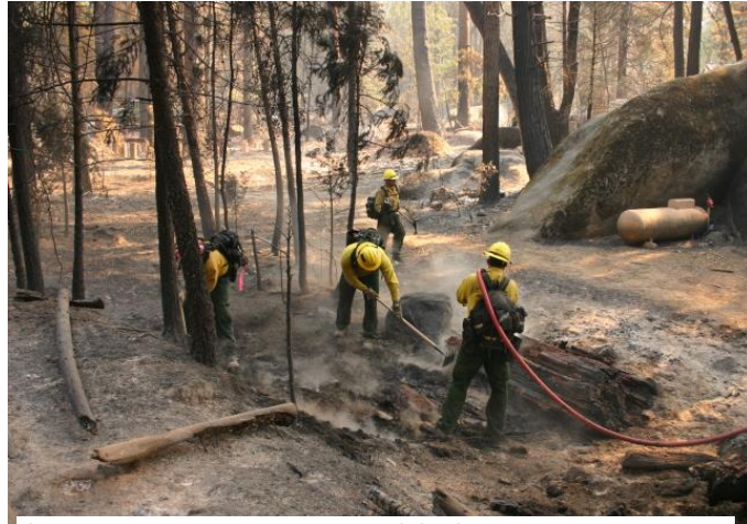
Crews clean up from the 2013 Rim Fire that threatened the Hetch Hetchy Water System

Within San Francisco, a small portion of the Crocker Amazon neighborhood has been designated as a high fire hazard severity area by CAL FIRE. Moderate fire hazard severity areas in the city include wooded areas such as Mounts Sutro and Davidson, as well as Yerba Buena Island. A significant portion of the Hetch Hetchy Regional Water System in San Mateo, Santa Clara, and Tuolumne Counties is also located in state-designated very high fire hazard areas. This can impact the system through increasing sedimentation, damaging pump stations and other associated infrastructure. Global warming and lower precipitation rates due to climate change are increasing the risk of damaging fires in Northern California.