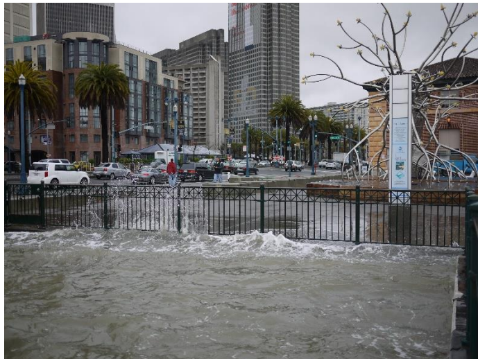
King Tide Flooding

Parts of San Francisco's shoreline currently experience temporary flooding during extreme high tides and coastal storm events. As sea level rises, temporary coastal flooding will be more frequent and will flood larger areas. Areas that are particularly susceptible to increasing risk of coastal flooding include Mission Bay, Islais Creek, Hunters Point, Candlestick Point, the Financial District, the Marina District, Treasure Island, and SFO.