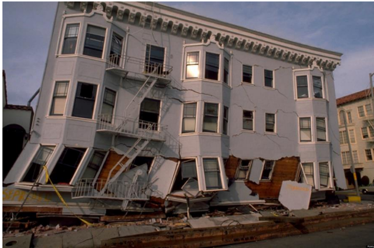
Damage from the 1989 Loma Prieta Earthquake

San Francisco has experienced several devastating earthquakes in its history, and there is a 72 percent chance that an earthquake of magnitude (Mw) 6.7 or greater will strike the region between now and 2043, which would result in widespread casualties and infrastructure damage. The energy released in earthquakes can produce different types of hazards, including groundshaking, liquefaction, tsunami, landslide, fire-following-earthquake, and dam failure. All of San Francisco is susceptible to very strong to extreme ground shaking during a major earthquake. Liquefiable soils in San Francisco are generally found in water saturated sandy or silty soils or landfill along the Pacific coast and San Francisco Bay.