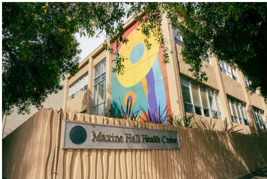
Maxine Hall Health Center, a concrete building that was seismically retrofitted in 2022