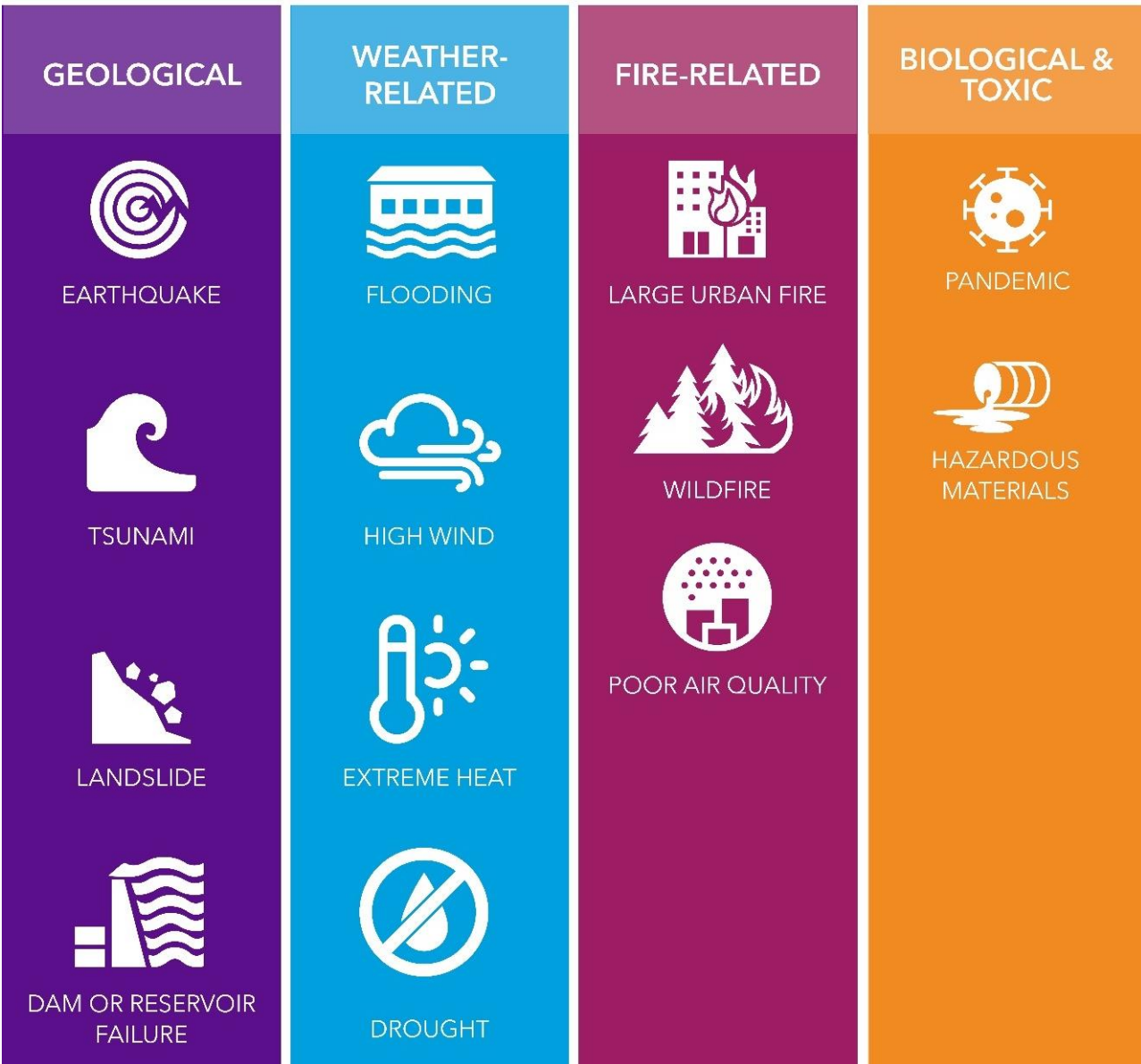
FIGURE ES-3: NATURAL HAZARDS PROFILED IN THE HCR

The HCR profiles 13 natural hazards that impact San Francisco, as listed in Figure ES-3 below and discussed in Chapter 04. The hazards are grouped into four categories; geological, weather-related, combustion-related, and biological/toxic. The profiles describe past events, location, extent, probability of future events and potential impacts.