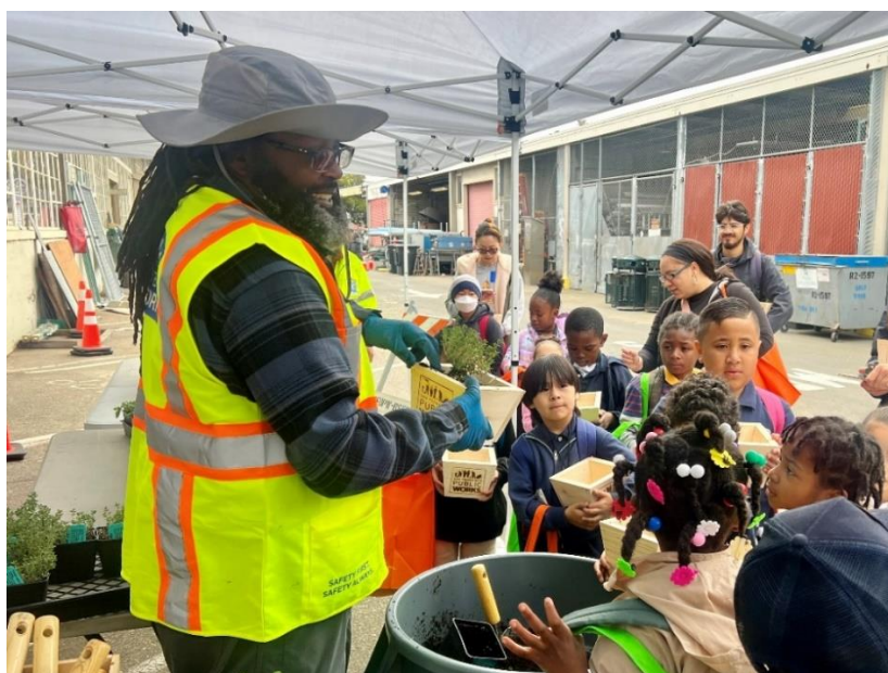
Arbor Day 2024