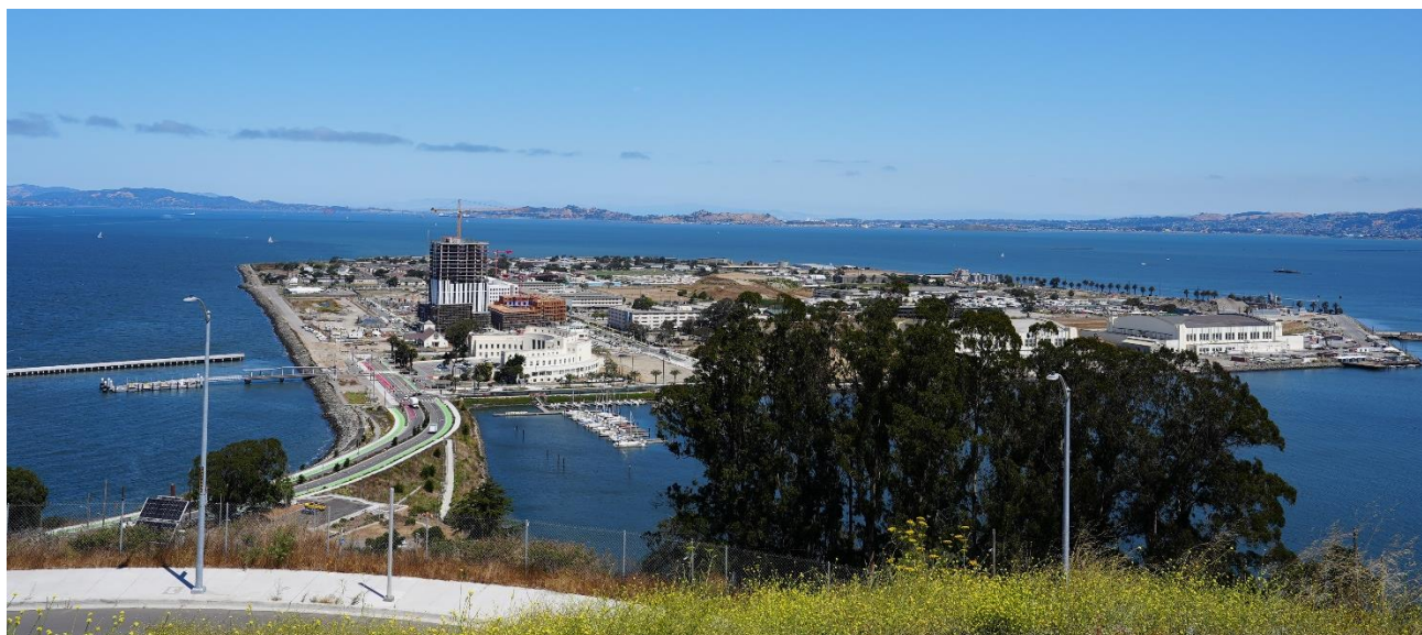
Treasure Island as seen from Yerba Buena Island