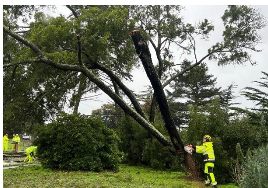
Tree Damaged by High Winds

The most disruptive "high winds" occur either with strong storms in the winter or spring, or in late fall as part of the warm "Diablo winds". The "Diablo winds" can stoke fires in nearby counties and transport smoke to San Francisco. Storm-related wind can down trees or power lines and contribute to electrical outages.