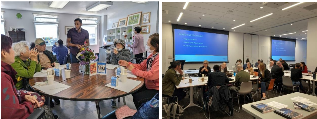
FIGURE ES-2: COMMUNITY AND STAKEHOLDER ENGAGEMENT EVENTS

This approach included working with a multi-departmental team and departmental leadership to identify information that has changed since 2020 and new priorities. Community engagement focused on attending existing community convenings hosted by community organizations rather than creating standalone workshops. This outreach emphasized receiving feedback from Environmental Justice (EJ) Communities and community organizations that were partners on the 2020 HCR. Lastly, the Project Team leveraged other opportunities for engagement, such as meetings with organizations by request, attending the Waterfront Flood Study Public Workshops, and hosting a workshop at the San Francisco Lifelines Council.