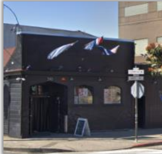
San Francisco Eagle