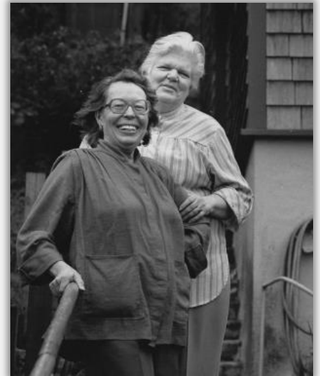
Lyon Martin House