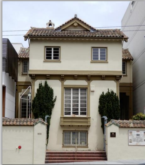
Japanese YWCA Issei Women's Building