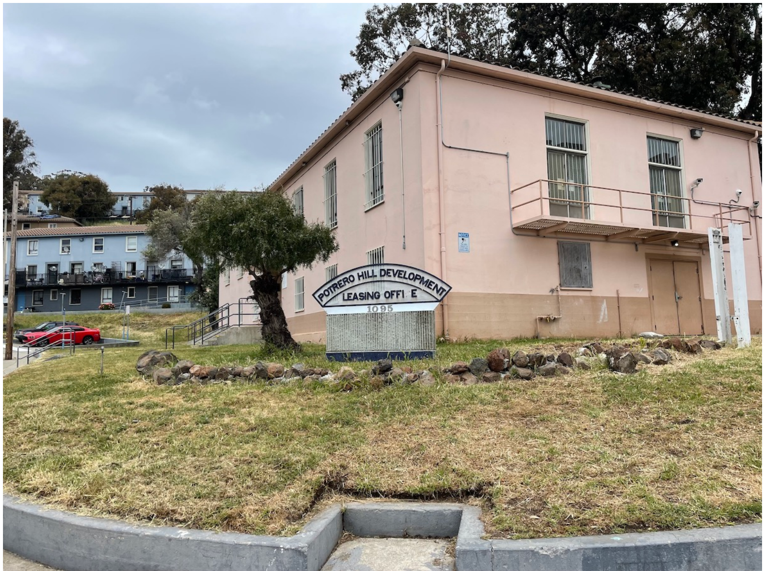
The SFHA's old office at the Potrero Terrace-Annex. Taken May 5, 2023.

The sprawling, 54-building Potrero Terrace-Annex public housing complex is being mismanaged by the private company in charge of day-to-day operations, according to a review of the firm's performance by San Francisco city officials obtained through a public records request.