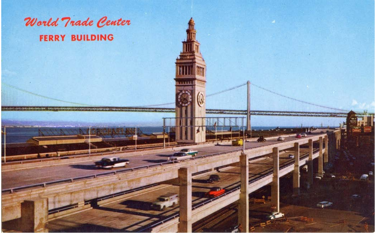
Special Interests then, Standard Oil, Car Manufacturers, Firestone put residents & tourists literally in the dark.

The special interest groups today are the billionaire investors from far off lands, the real estate industry interests in luxury condos for the very few, the paid shills and lobbying groups, and the political ladder-climbing legislators in Sacramento. After all, their goal is to just build, sell to the highest bidder, then move on to the next "venture" or take the next step up the ladder. More often than not these days, we have vacant luxury condos where money has been parked, but no one is "home'; no one is adding, contributing to our communities.