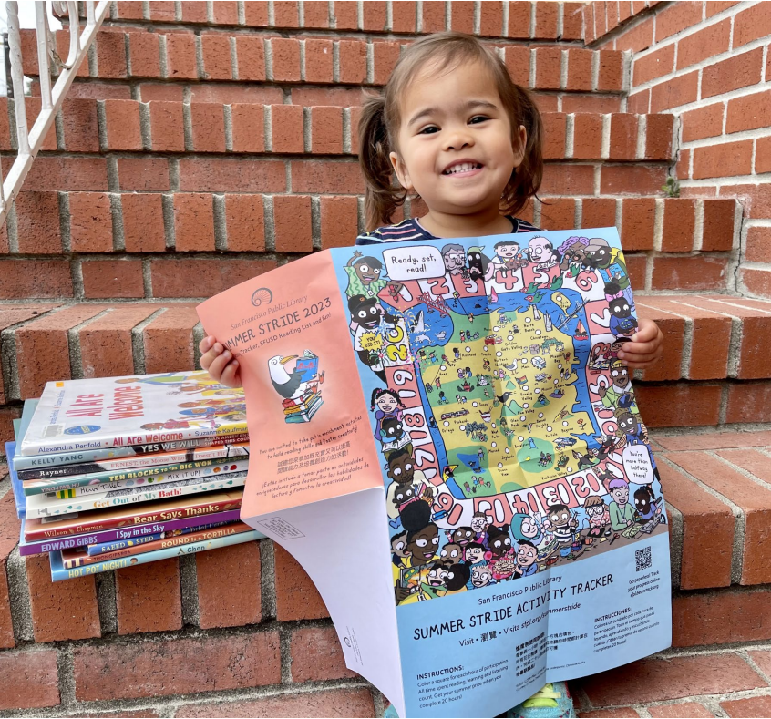
San Francisco Public Library | FY25 & 26 Proposed Budget