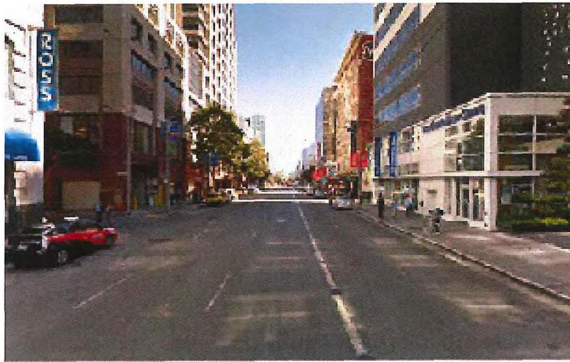
10 4th St San Francisco, CA 94103