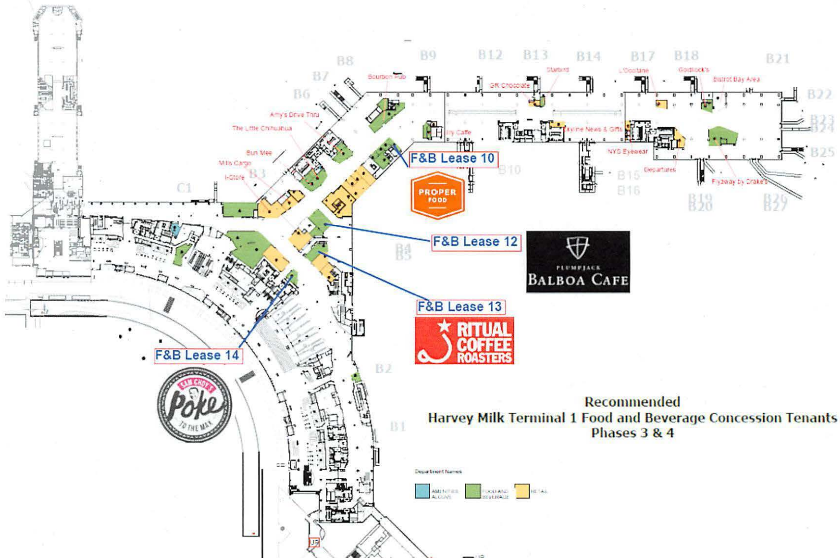
Recommended Harvey Milk Terminal 1 Food and Beverage Concession Tenants Phases 3 & 4