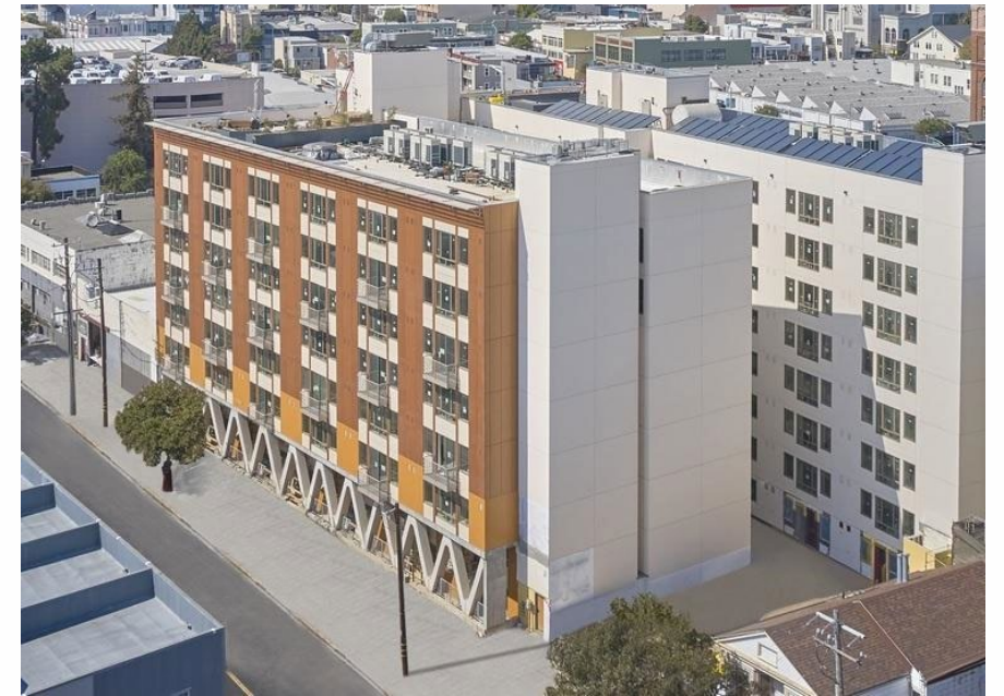
City Gardens – 200 Units of Supportive Housing for Families