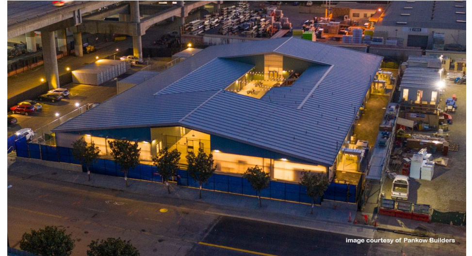
Bayview Navigation Center