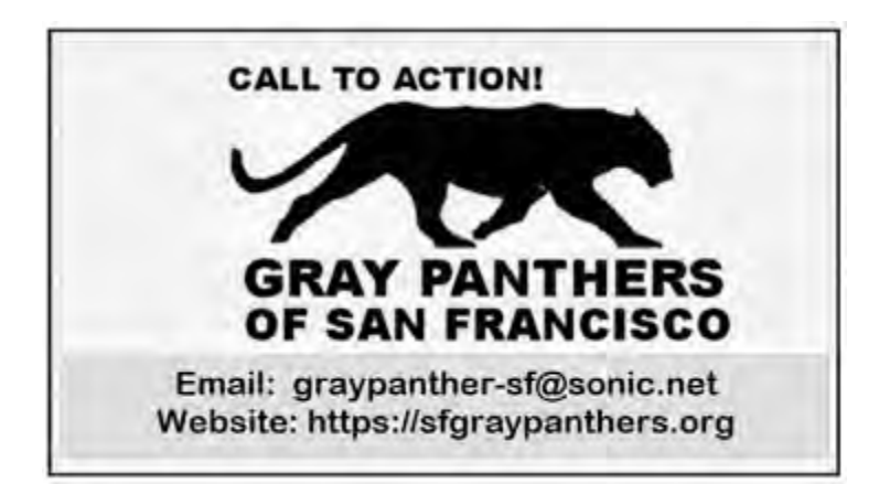
2024 July 7

This message is from outside the City email system. Do not open links or attachments from untrusted sources.