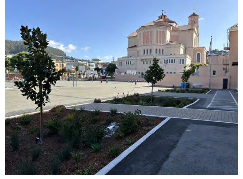
Completed construction of new permeable parking area