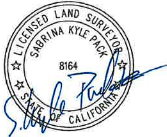
EXHIBIT A-1 ILLUSTRATIVE PLAT TO ACCOMPANY LEGAL DESCRIPTION

WEST HARNEY WAY LOTS J AND X, FINAL MAP NO. 12681 CITY AND COUNTY OF SAN FRANCISCO, CALIFORNIA MAY 26, 2026