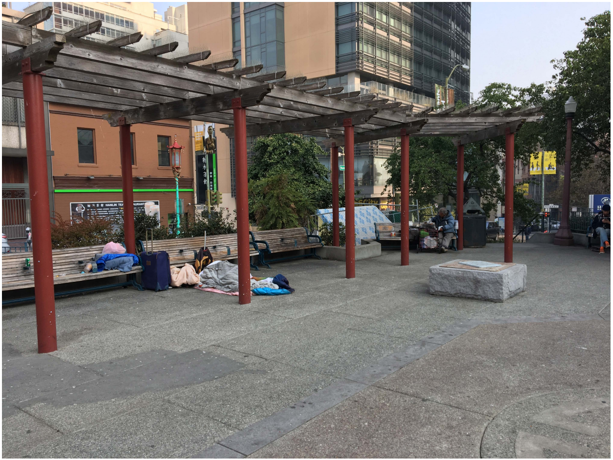
Small text caption or metadata.