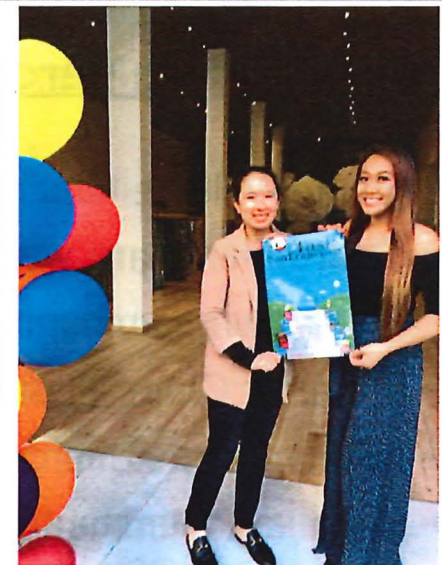
Kim Ono Kimonos Participating with Balloons and In-Store Specials