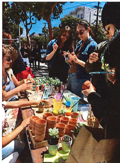
Customer Engagement That Could Not Take Place in the Store