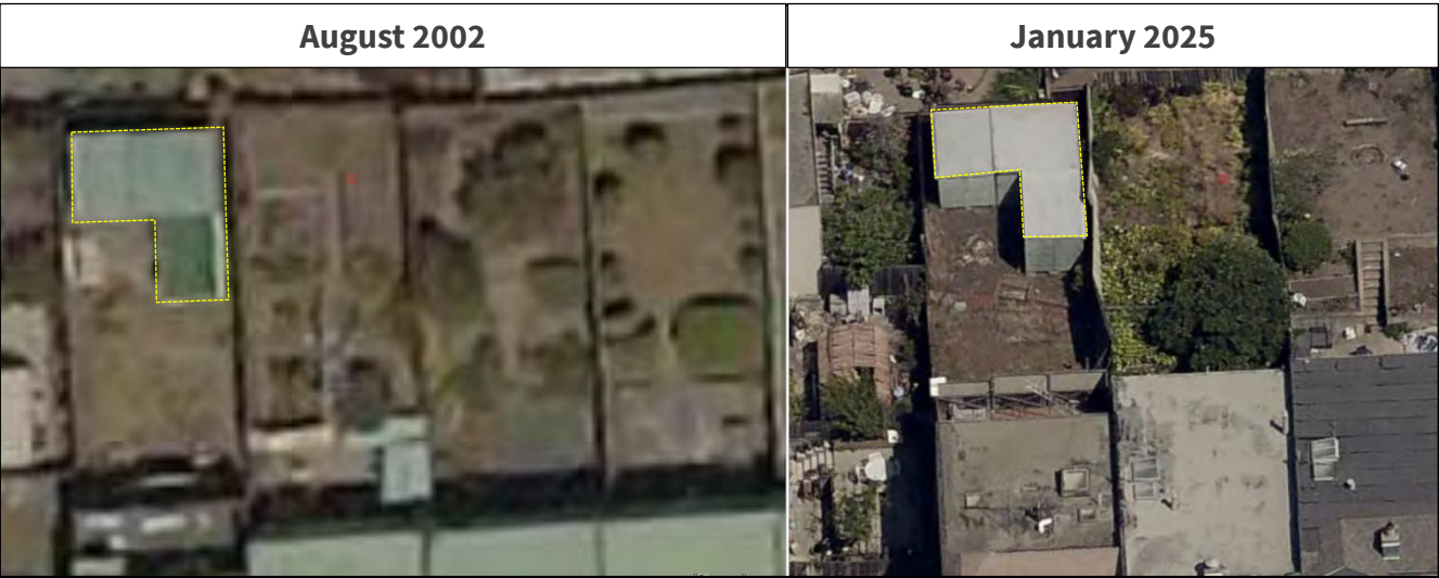
Two EagleView images of a lot in the Sunset District with a rear yard structure. The structure is approximately 325 square feet and therefore would not be allowed without a Variance. Under the proposed Ordinance, because this structure has existed with the same dimensions since at least January 1, 2003, it would be allowed to be repaired and/or replaced. The structure could also be expanded or relocated to the extent needed to comply with the Building Code.

The Department uses a program that has high resolution satellite imagery from both bird’s eye and angled positions that make it possible for staff to understand the built conditions on individual lots in the city. The satellite images go back to 2002. These images from 2002, compared with the most recent conditions on the lot, allows the Department to determine not only if a rear yard structure existed as of January 1, 2003, but also the general dimensions and placement of the structure on the lot as of January 1, 2003.