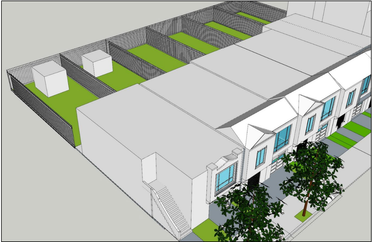
The proposed Ordinance would allow a 10-foot tall, 120 square foot structure (left). The Current Code allows an 8-foot tall, 100 square foot structure (right).