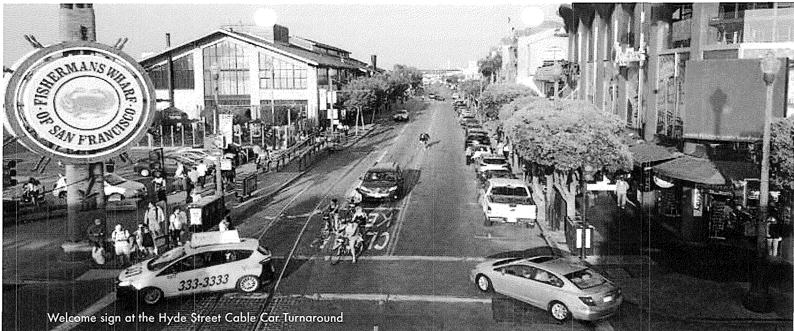
Welcome sign at the Hyde Street Cable Car Turnaround