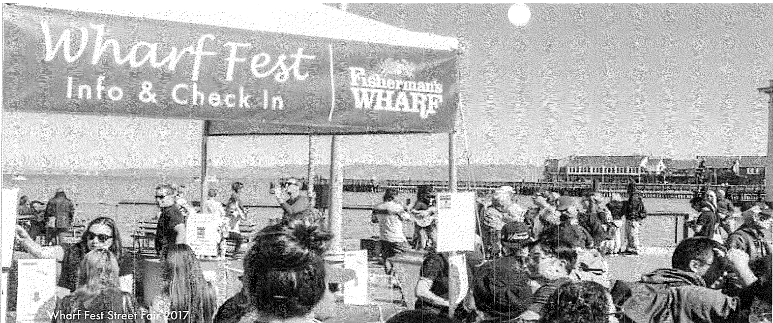
Wharf Fest Street Fair 2017