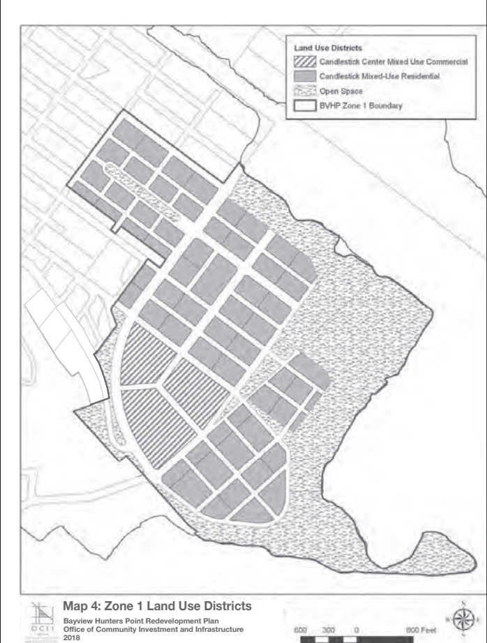
Bayview Hunters Point Redevelopment Plan July 16, 2018