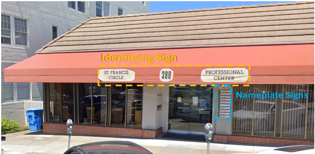
An example of Identifying and Nameplate Signs

Residential Districts can be found in “The Way It Is” section of this report. Generally, signage in these districts is limited to Nameplates and Identifying Signs. An Identifying Sign serves to tell the name, address, and the permitted use of a location. A Nameplate Sign is a flat Sign affixed to the wall of a building and contains the name or profession of the people occupying the building.