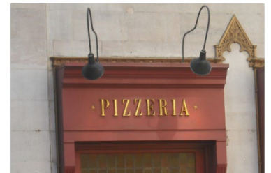
Example of an Indirectly Illuminated Sign

The Planning Code also regulates the illumination of permitted signs. Although illuminated signs can attract wanted attention to a business, they can also negatively affect neighboring tenants and residents if not illuminated appropriately. Within Residential Districts, signs may either be non-illuminated or indirectly illuminated. An indirectly illuminated sign is a sign illuminated with a light directed primarily toward the sign and shielded that no direct rays from the light are visible elsewhere than on the property where the sign is located.